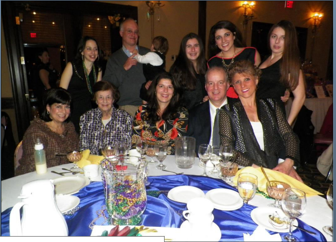
SS. Peter and Paul Philoptochos Glendi