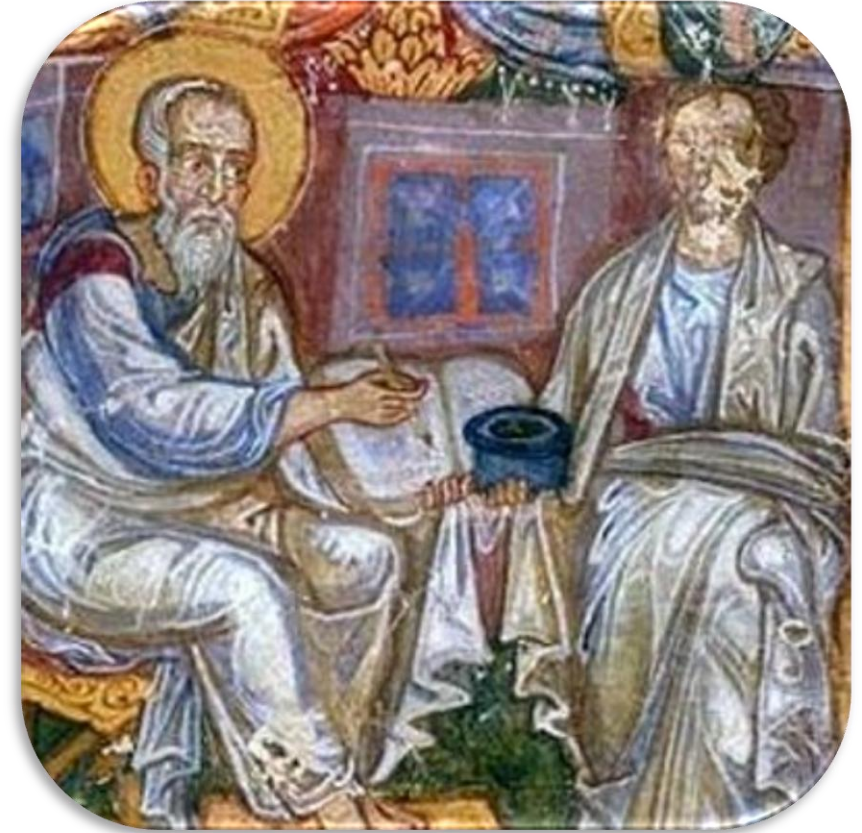
Marcion (late 1 st -mid 2 nd century AD)