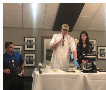
The Glenview coarse sip and savour