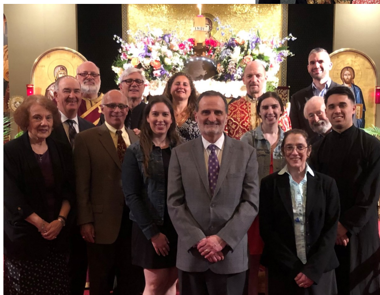
Parish Council Members unite prior to Holy Friday service.