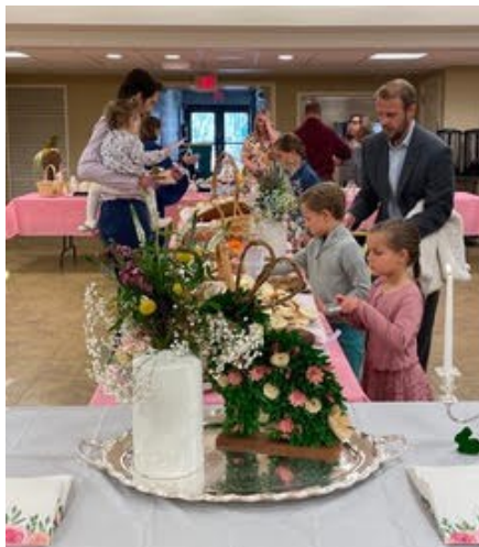
A family enjoys refreshments following Palm Sunday Liturgy.

We would like to thank everyone who joined us in Fellowship Hall on Palm Sunday, and all the volunteers and customers who helped us achieve a very successful bake sale that day. While we don't have our final numbers yet, we sold out of a lot of our pastry, and less than a dozen of our 325 tsourekia and just a few Easter baskets remained by the end of the day. Sales were spurred by our wonderful volunteers who know first hand the love and premium ingredients that go into all of our baked goods. We extend our deep gratitude to all those who supported us. They can feel good about their purchases and know proceeds go to helping those in need.