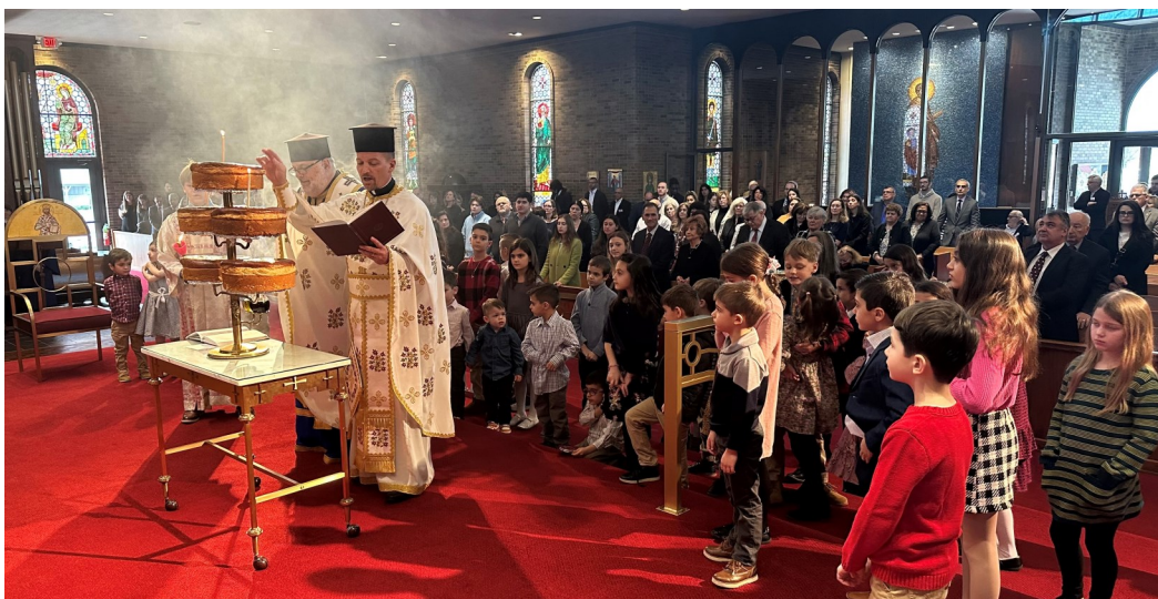
Church School students get up-close view of an artoclasia.