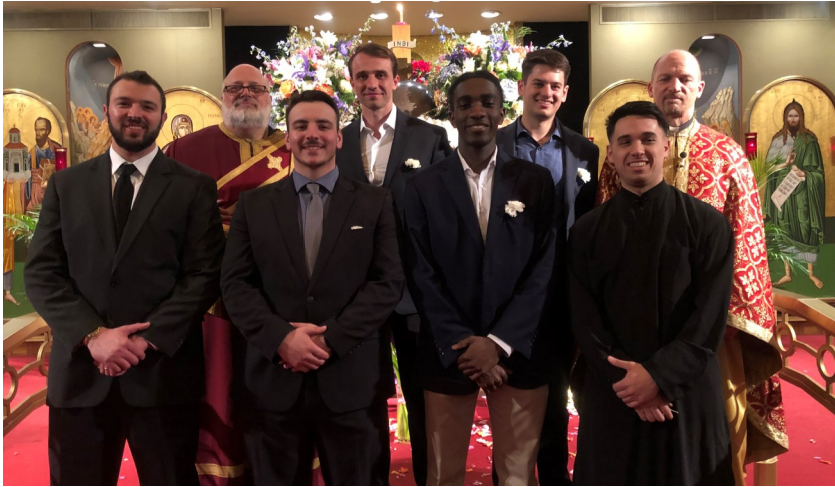
Kouvouklion bearers gather prior to Holy Friday evening services. Acolytes and myrrhbearers prepare for the journey outside.