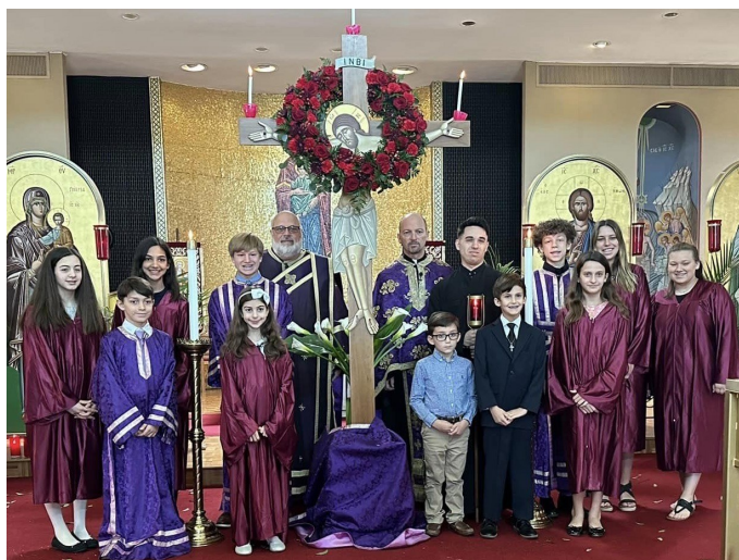
Myrrhbearers and acolytes gather for Holy Friday morning, afternoon and evening services.