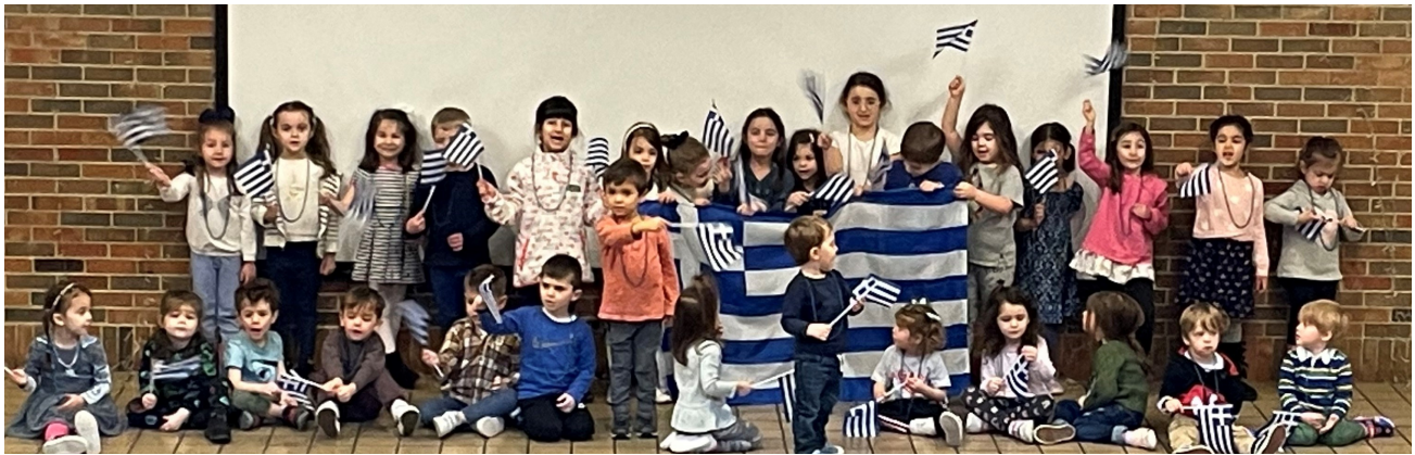
AGAPE students celebrate Greek Independence Day.