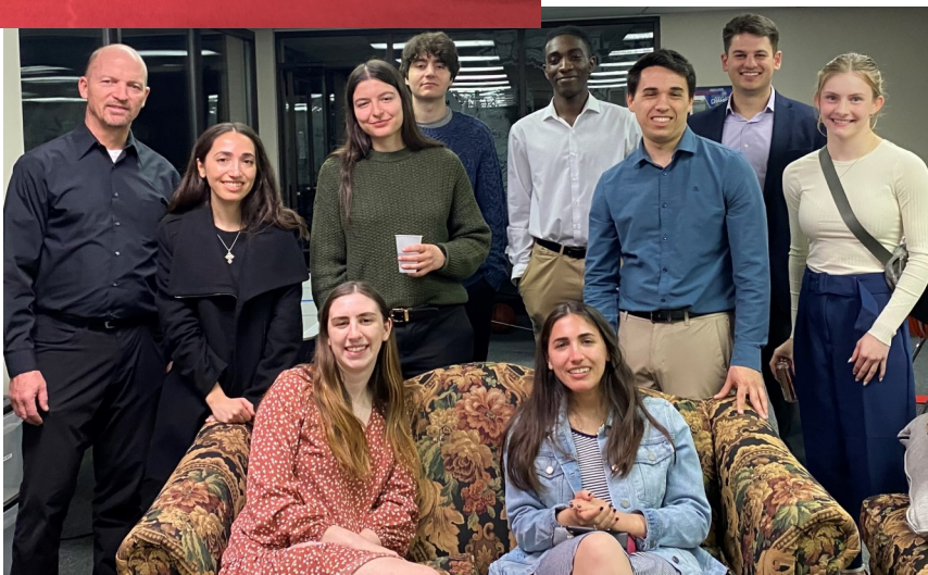
On April 10th, YAL members gathered for fellowship following a Bridegroom service.