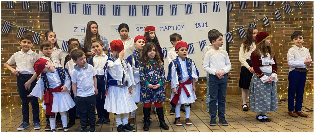
Greek School students celebrate Greek Independence Day.