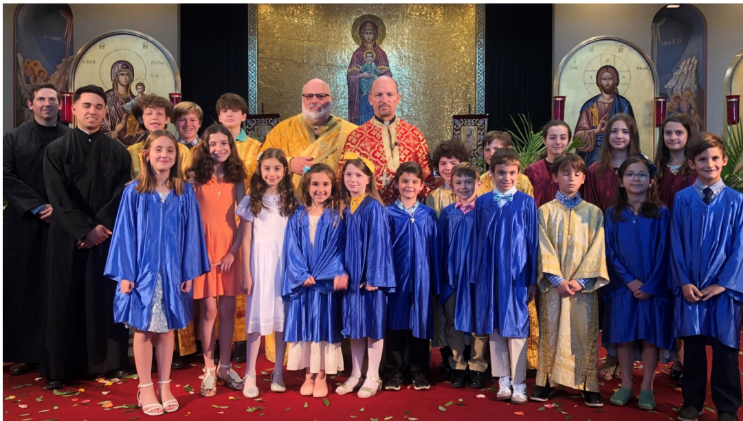
The SSPP Youth Choir sang for Holy Saturday morning service.