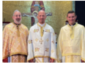
OUR LIFE TOGETHER