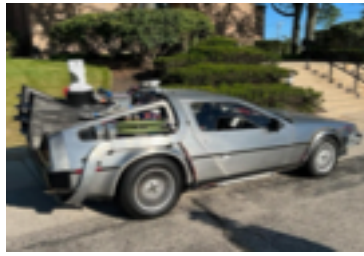
GREEK FEST SURPRISE