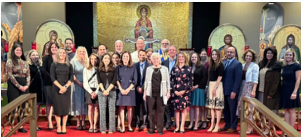
Thank you to our Church School staff! Have a great year!