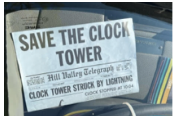
At our Greek Fest the Back to the Future car was spotted in our parking lot!!