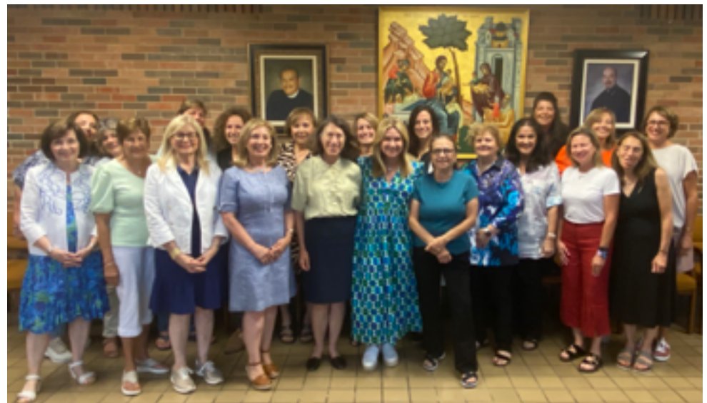
SSPP Philoptochos board started the Church New Year with a prayer service and meeting!