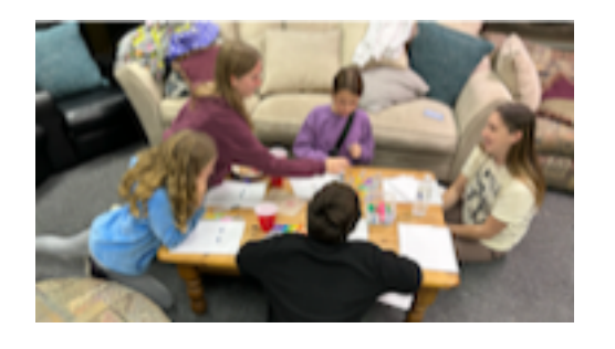
The Power of PINK