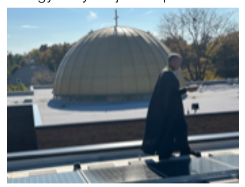
Solar Pannel Blessing <<<<