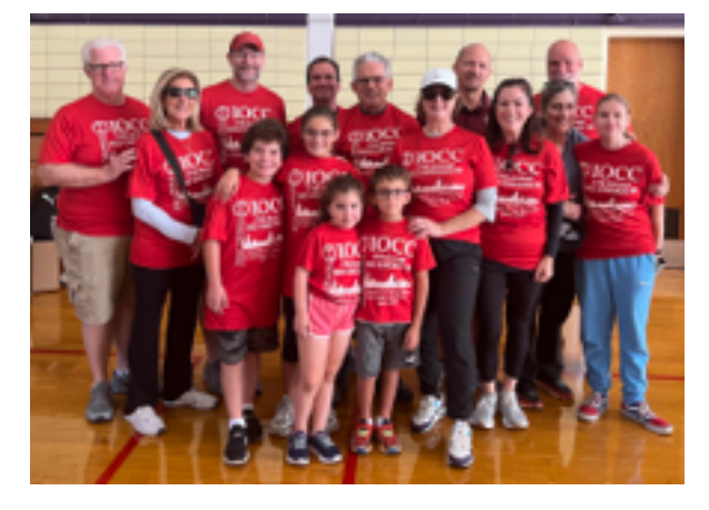
Team SSPP today at IOCC Chicago 5K! Beautiful weather and a stellar organization to support!