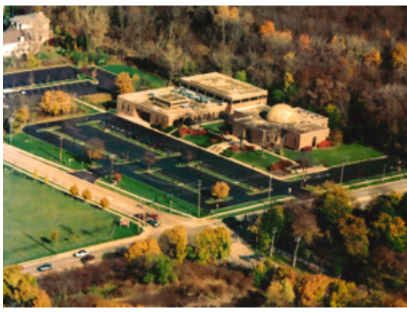
Older SSPP ariel view photo from 11/05/11