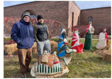
NATIVITY SET UP