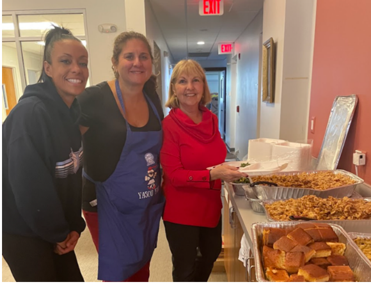
Feed the Hungry 11-5-23