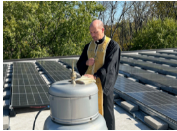
SOLAR PANEL BLESSING