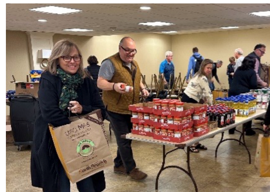
Volunteers from November 3 rd Project Hope Food Drive Bagging Events