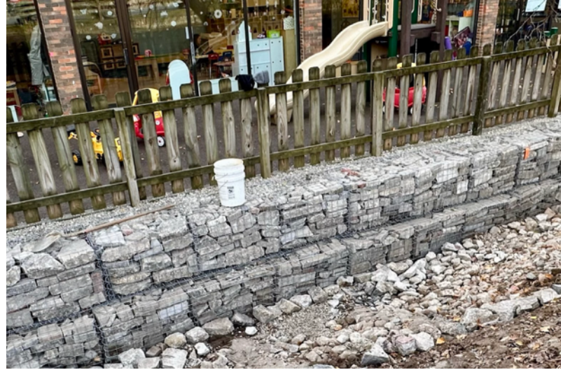
Creek Bed Remediation