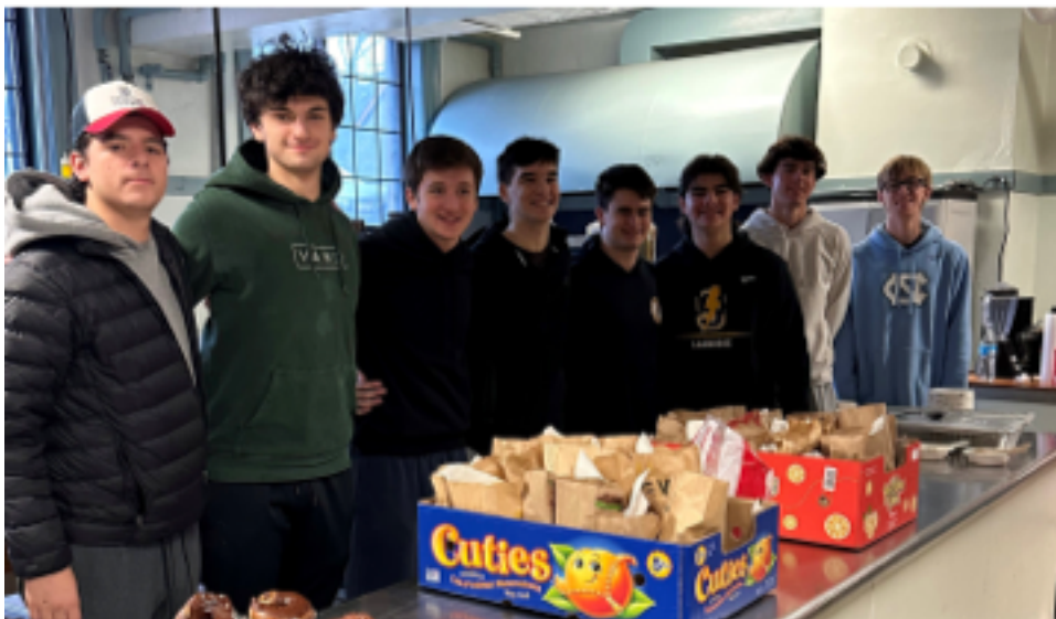
HS Boys Feeding the Hungry 12-29-23