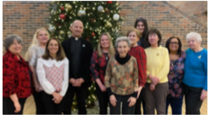
SSPP Staff and Volunteers 12-21-2024