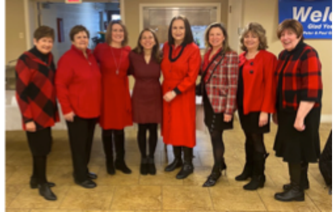
Women of SS Peter and Paul rocking red last year on National Wear Red Day.

February is American Heart Month. Join us in wearing red to church on Sunday, February 11 , as our way to stand in support of eradicating heart disease and stroke, a leading cause of death for Americans.