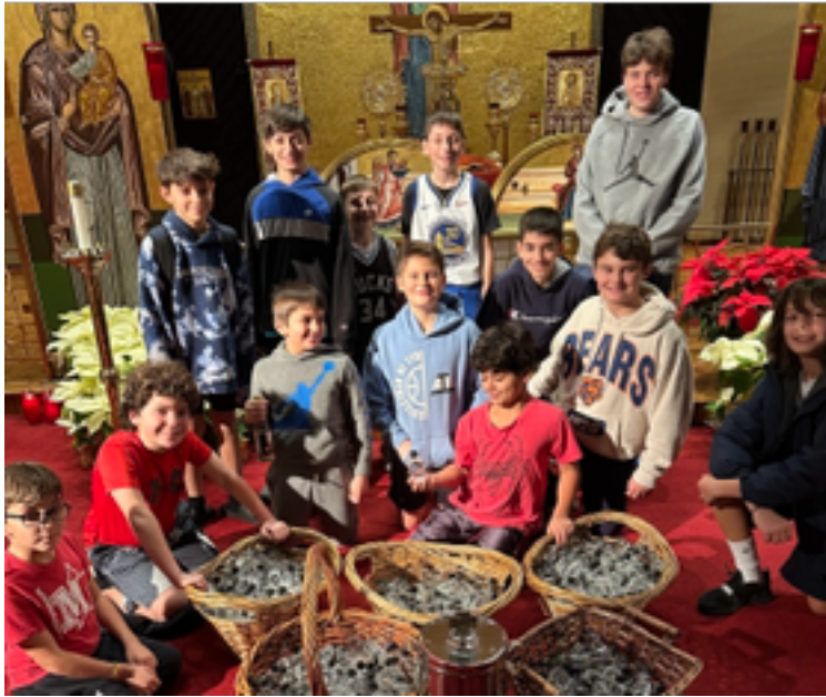
Youth Epiphany Water Bottles 1-2-2024