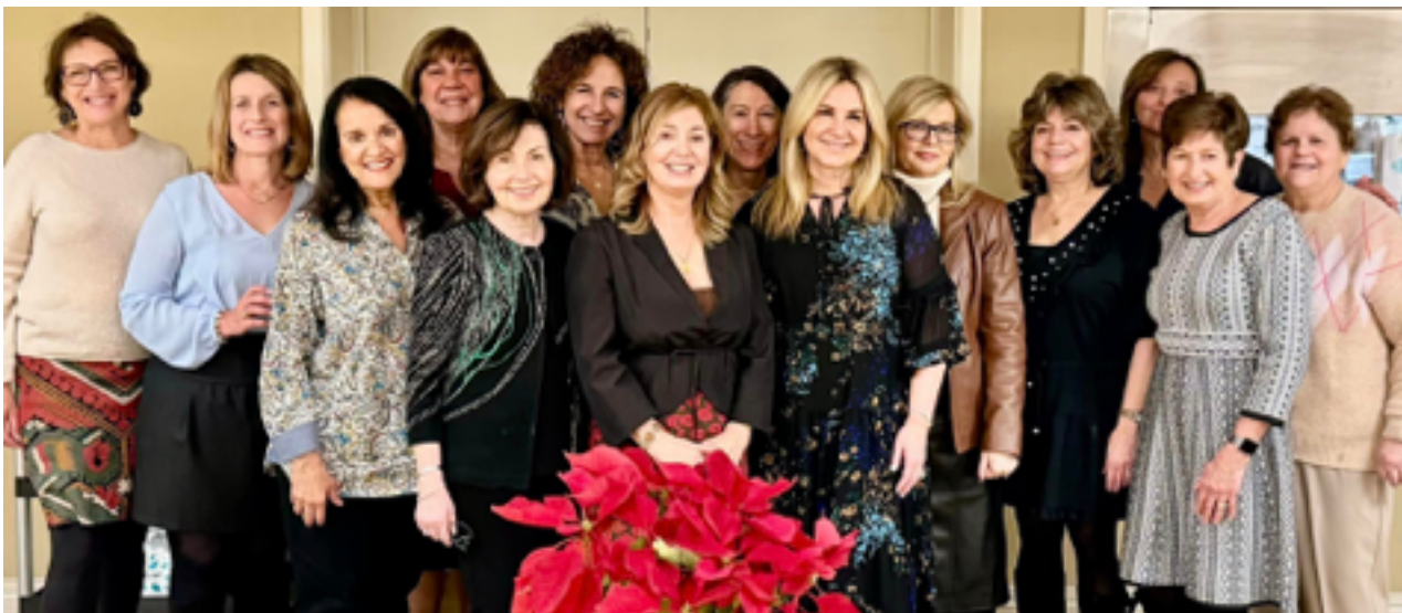
Philoptochos Vasilopita 1-7-24