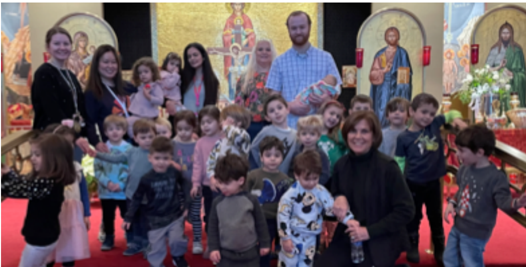
APAGE Students 1-9-24