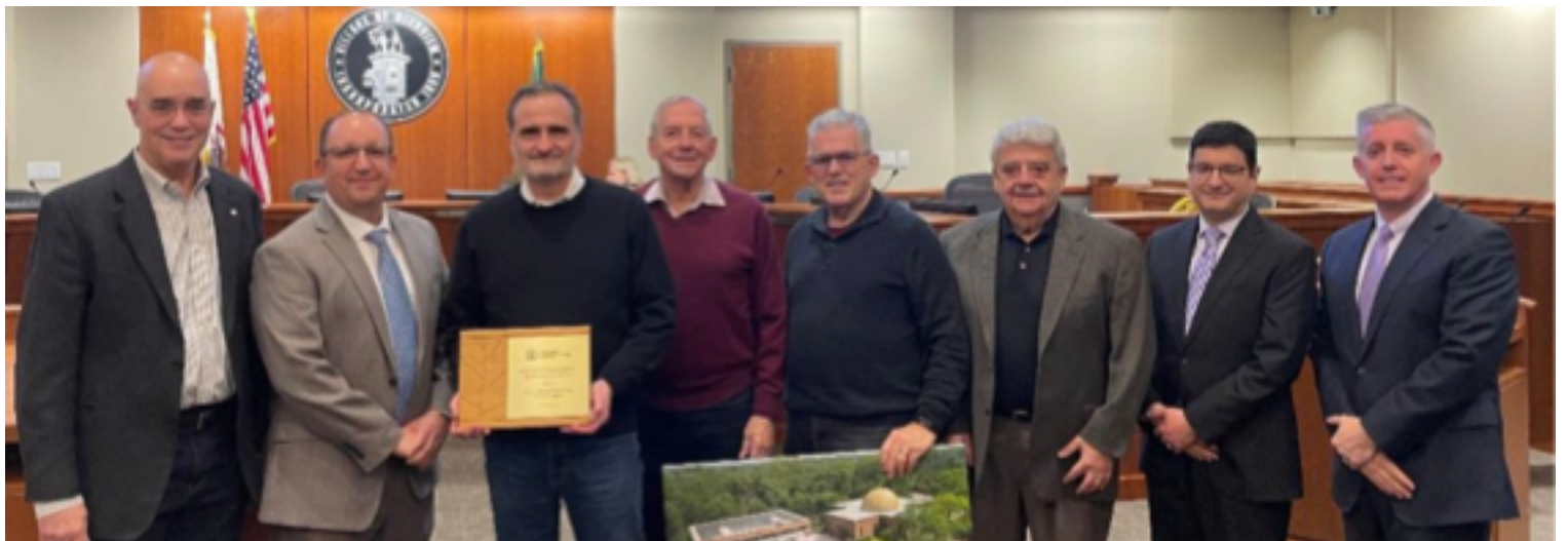
Glenview Environment Award 1-24-2024