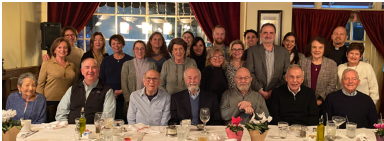
Parish Council Past Presidents Dinner 1-30-2024