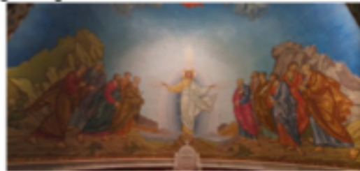
(Icon of the great commission from the Cathedral in Tirana)

I also serve on the steering committee of the Lausanne-Orthodox Initiative (LOI), which has given me the opportunity to work with Orthodox and evangelical leaders from around the world. I have represented the Orthodox Church of Albania at two Global Gatherings of the Global Christian Forum (GCF): first in 2011 in Manado, Indonesia, where I gave a plenary address about the resurrection of Orthodox Church of Albania, and again in 2018 in Bogotá, Colombia. In 2015, I led the local organizing team for the GCF's conference in Albania on the theme Discrimination, Persecution, Martyrdom: Following Christ Together . These experiences have given me the opportunity to work with Christian leaders from around the world and to understand more fully the opportunities and challenges in the process of building up the Church of Christ, which the gates of hell will not prevail against (Mt 16:18).