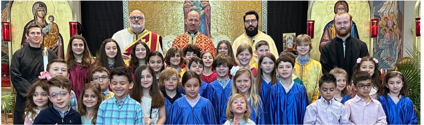
Holy Saturday Morning - Youth Choir