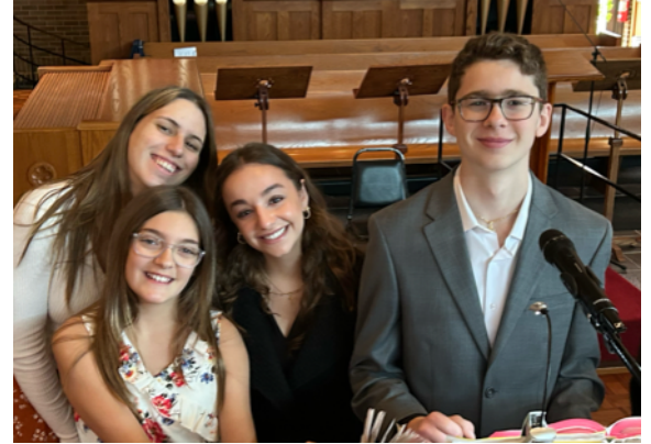
Chanters during the Decent of the Cross Service