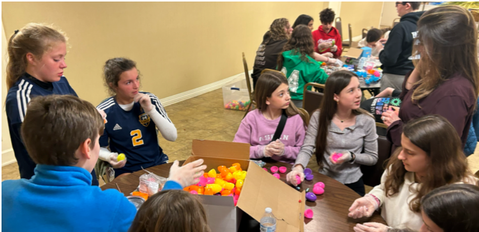
GOYANS Prepping Easter Eggs for Annual Egg Hunt