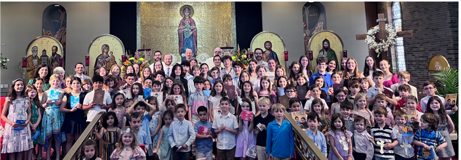
Church School Students, Teachers and Staff