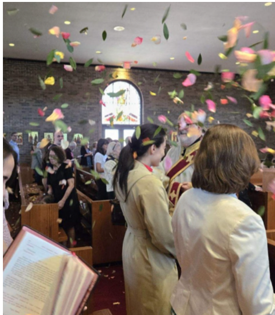
Holy Saturday morning liturgy