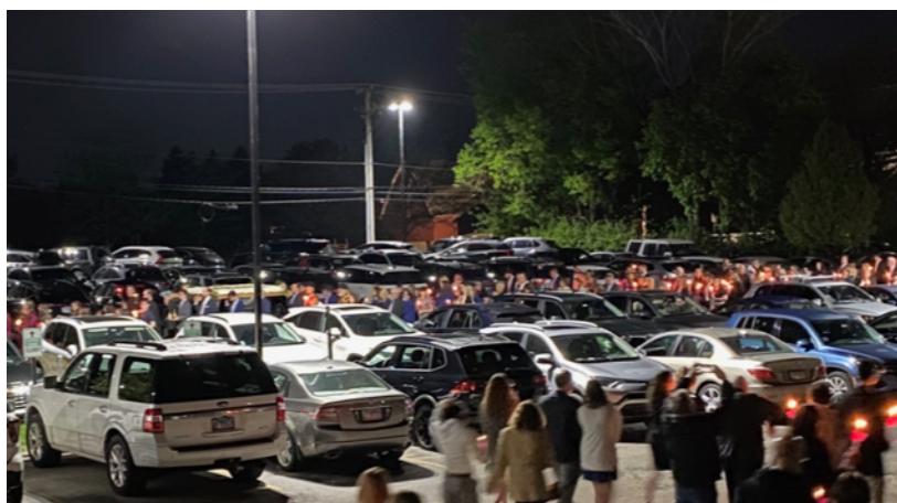
Holy Friday - Procession of Epitaphios