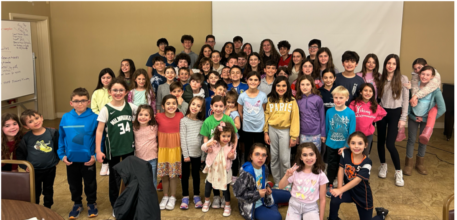
Our youth Group helped fold 1,000 Palms this year