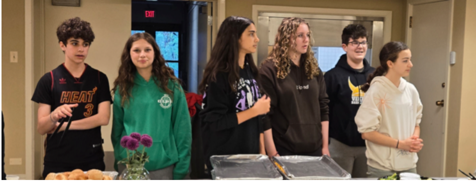
Junior Goyas helping serve food at Palm Folding