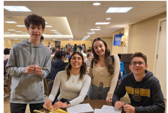
GOYANS at Palm Folding