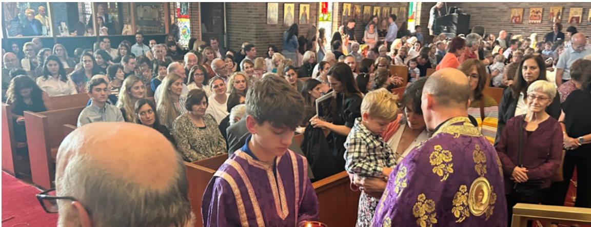
Holy Wednesday - Unction Service