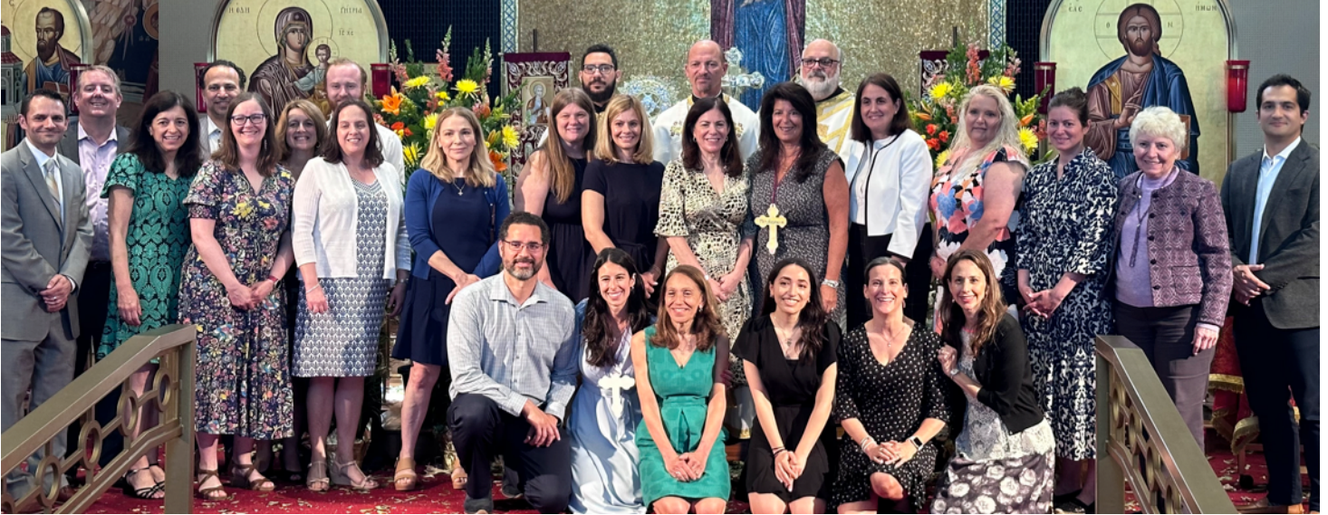
Church School Teachers and Staff