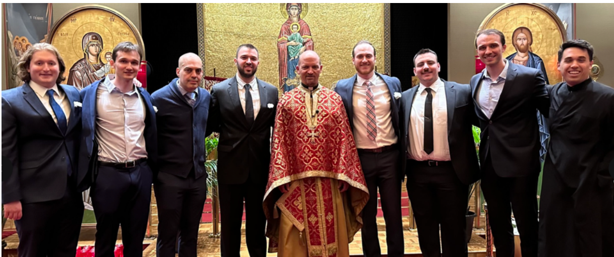
Kouvouklion Bearers - Holy Friday