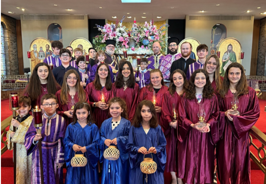
Holy Friday - Decent from the Cross Vespers