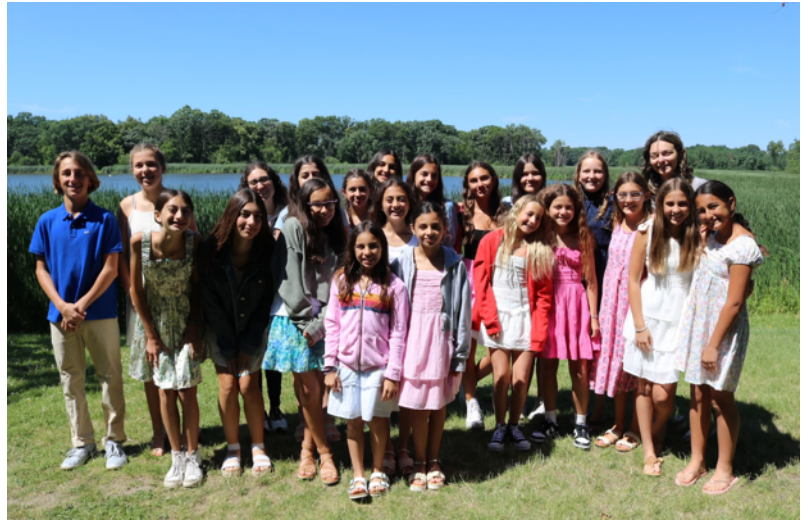
sspp fanari campers week 2 2024