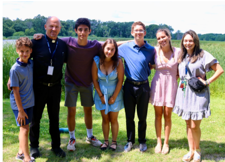
sspp fanari campers week 5 2024