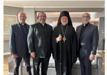
OUR LIFE TOGETHER