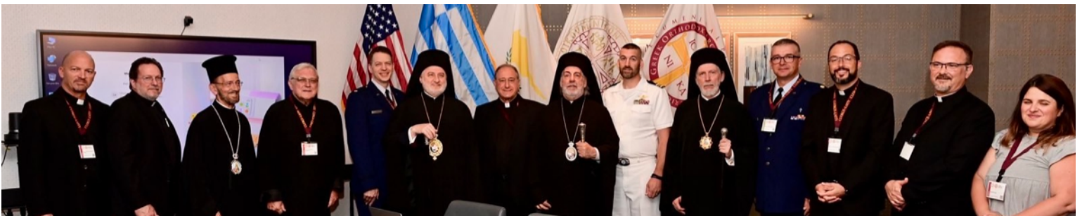
GOARCH Chaplains at Clergy Laity 7-3-2024