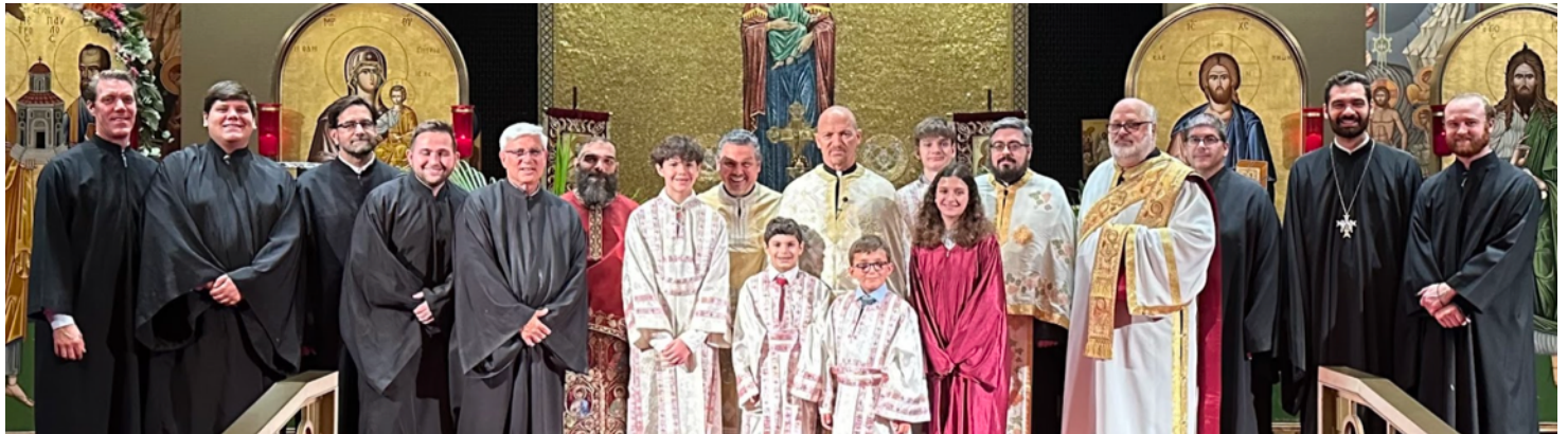
SSPP Feast Day Clergy Chanters and Acolytes 6-29-2024