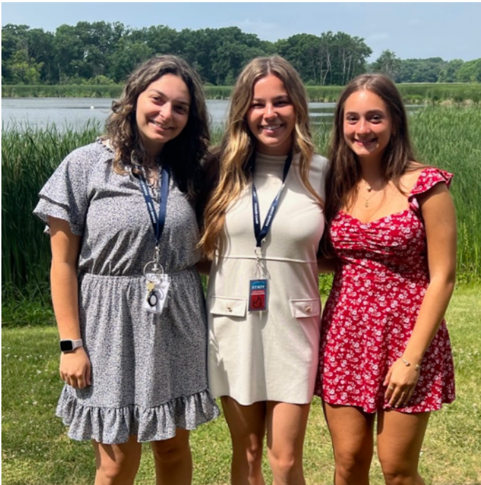
sspp fanari campers week 1 2024