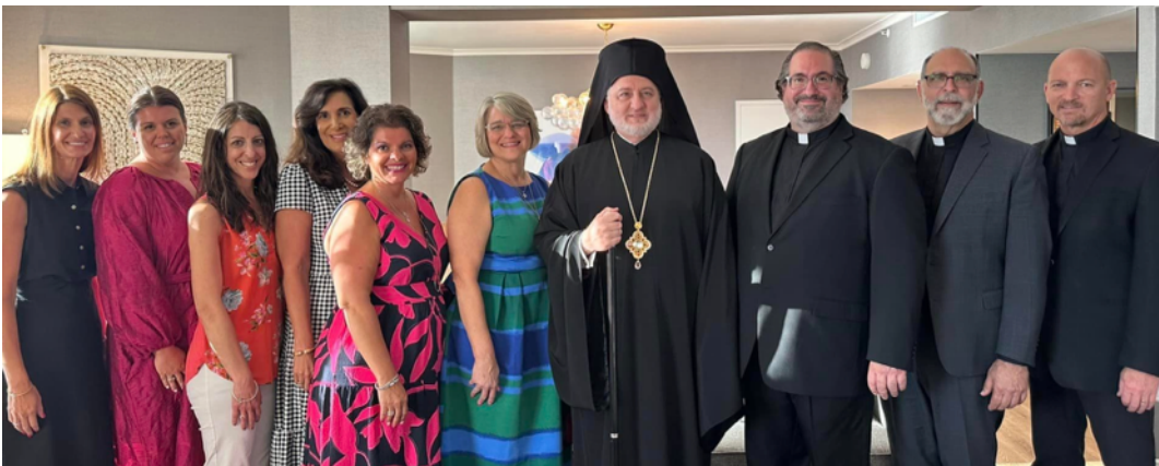
National Clergy and Presvytera Reps w Archbishop at Clergy Laity