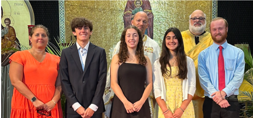
Project Mexico SSPP Team 7-14-2024