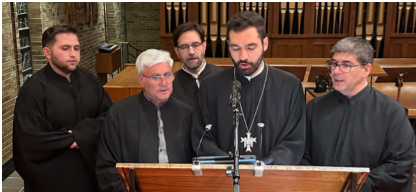
SSPP Feast Day Chanters 6-29-2024