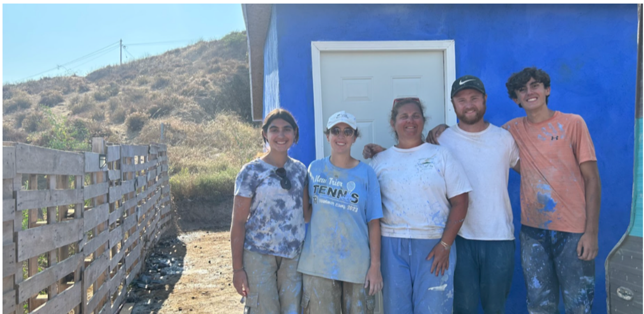
Project Mexico SSPP