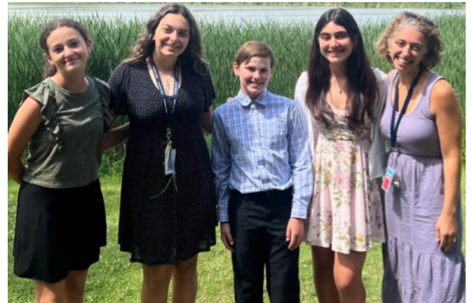
sspp fanari campers week 4 2024