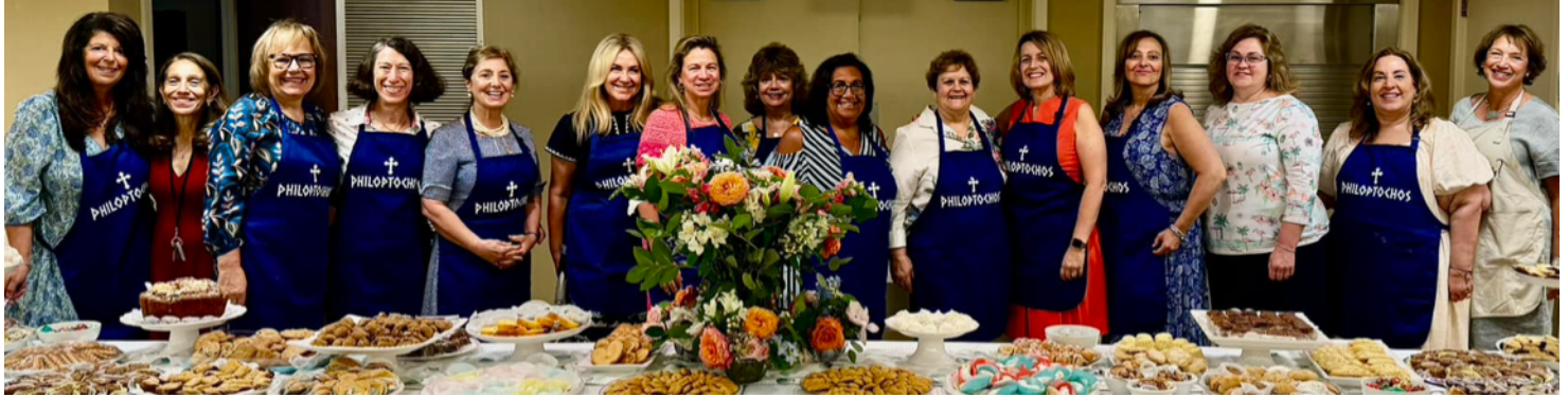
SSPP Feast Day Philotochos 6-29-2024