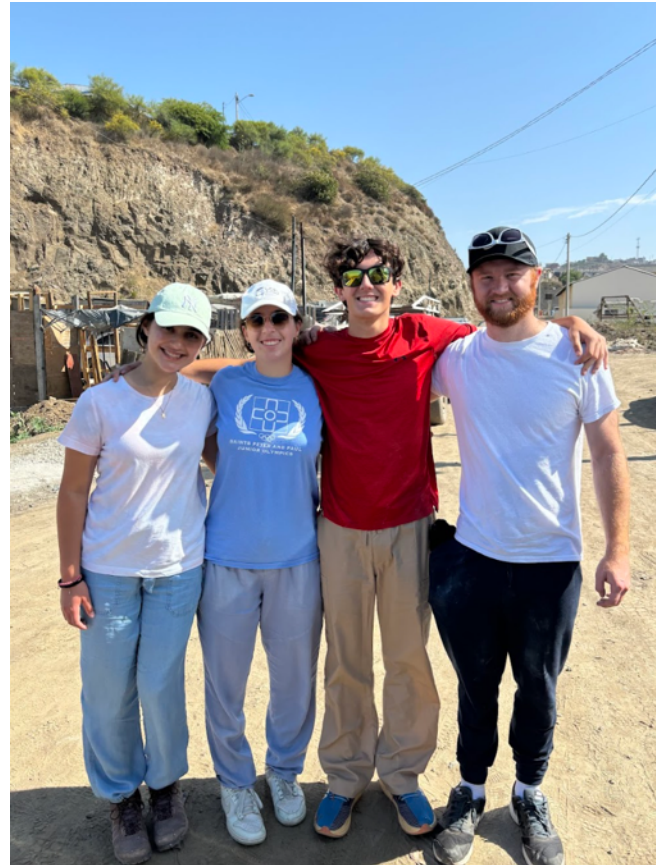
Project Mexico SSPP