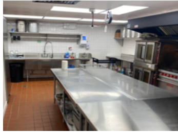
RENEWING GOD'S HOME