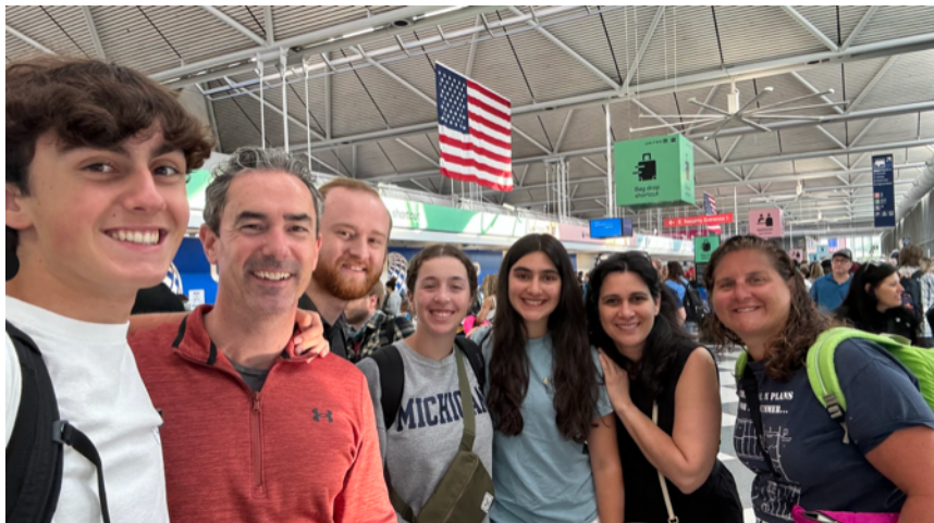
Project Mexico SSPP