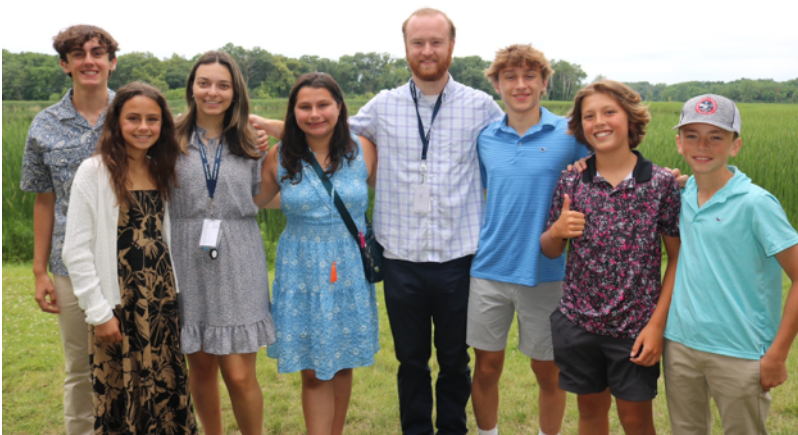
sspp fanari campers week 3 2024