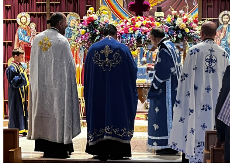
Clergy at Kimissis Racine WI 8-14-2024