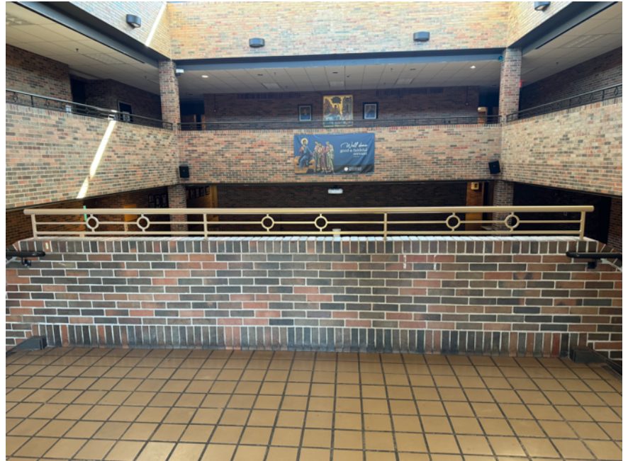
New Atrium Railings