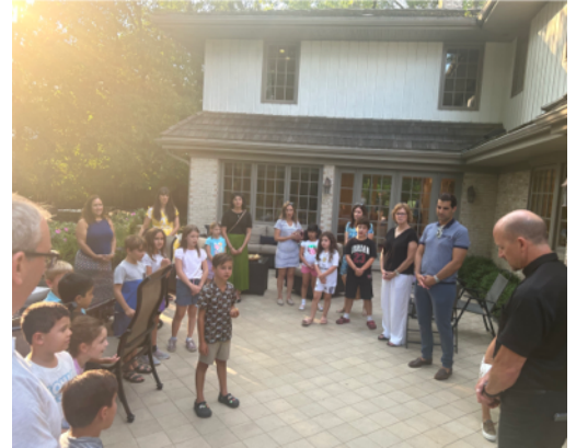
Faith Love and Joy at the Adam's House 08-02-24

I look forward to seeing everyone at these events as we embark on another year of faith, fellowship, and fun!