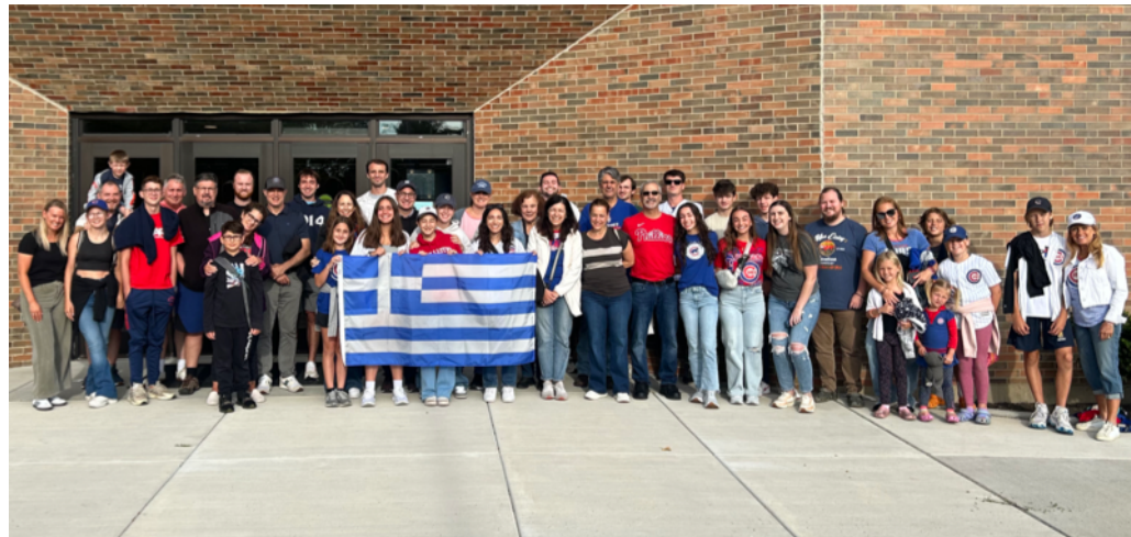
SSPP Group Photo Before Cubs Greek Heritage Night 08-30-24