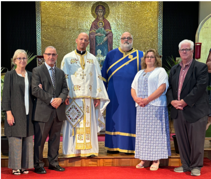
Prison Ministry Volunteers 7-28-2024