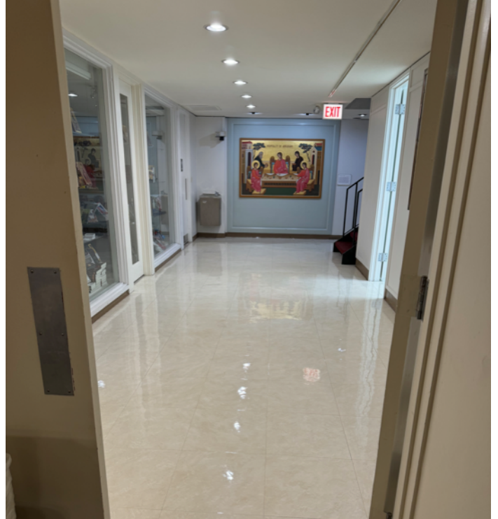
Refinished floor near the Bookstore