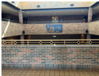
RENEWING GOD'S HOME