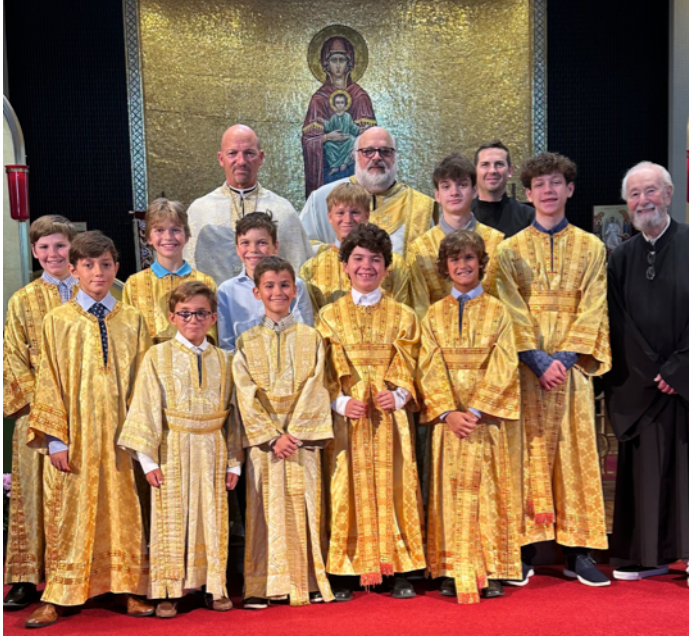
Acolyte Sunday 8-11-2024