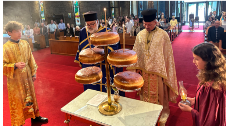
Dormition Liturgy Artoklasia 8-15-2024