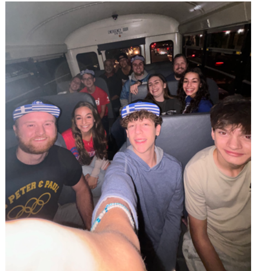
Cubs Game on 08-30-24 for Greek Heritage Night