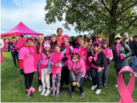
Some of our team members at 2023's Making Strides Against Breast Cancer Event.