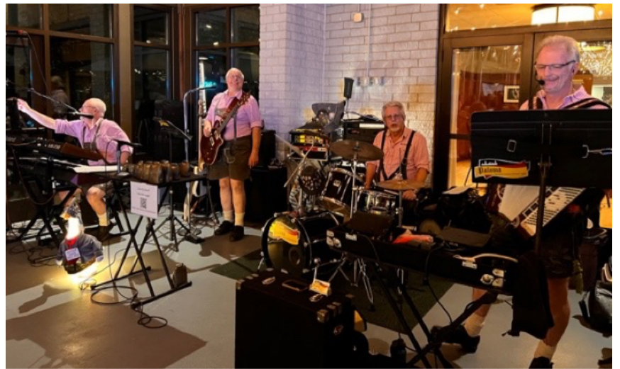
2023 Oktober Fest Highlights