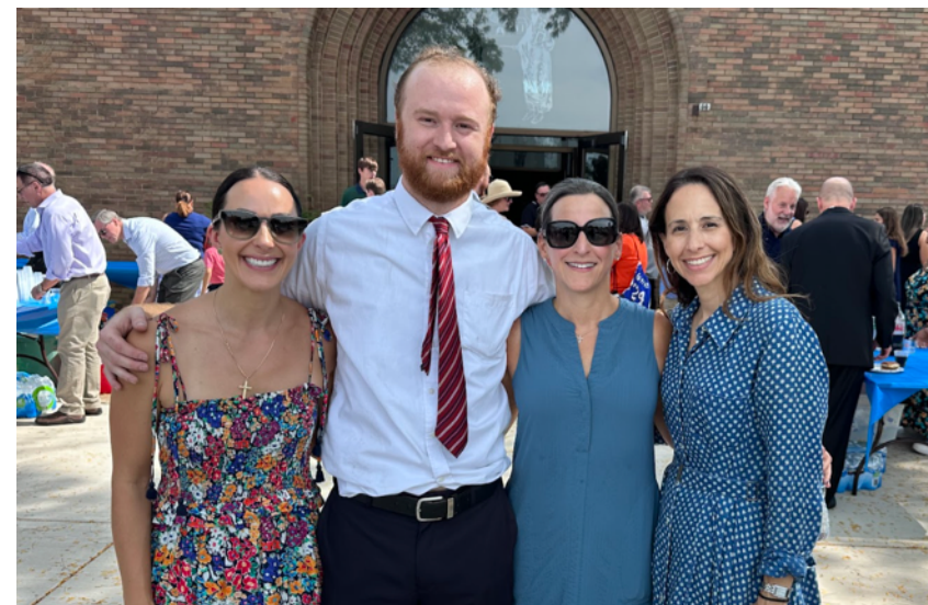
Picnic Organizers 9-15-2024