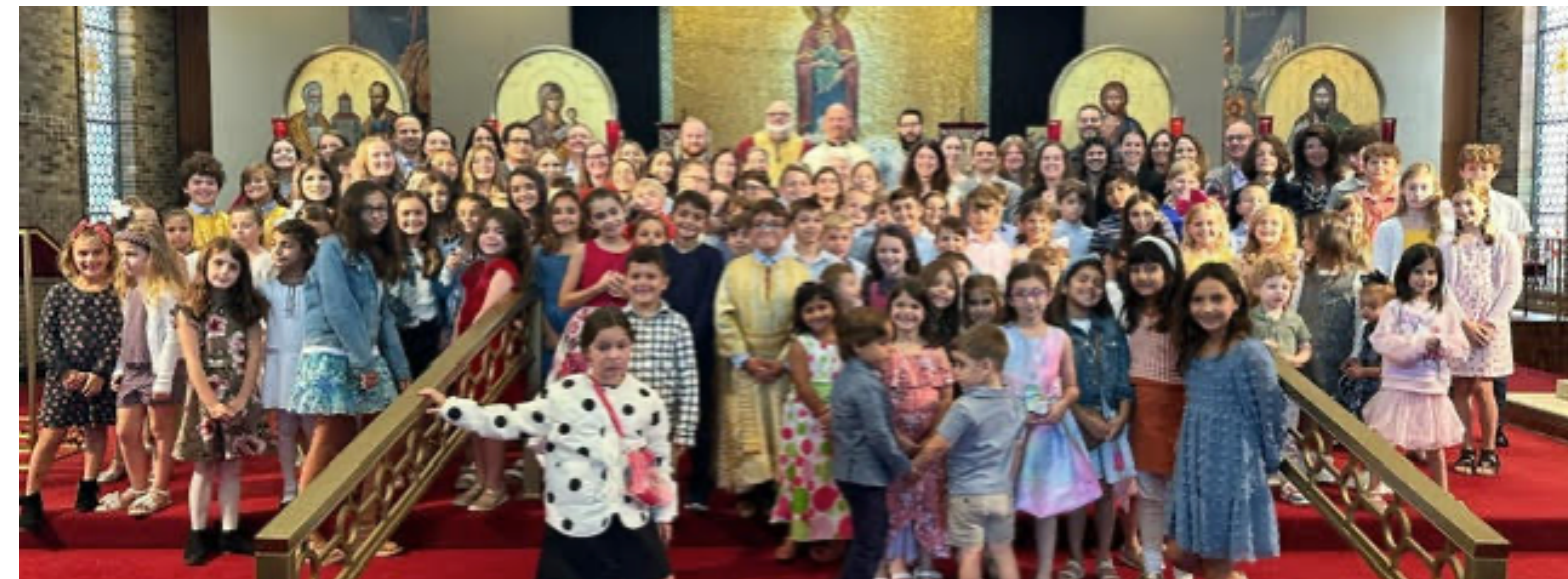
1st day Church-Sunday School 9-8-2024