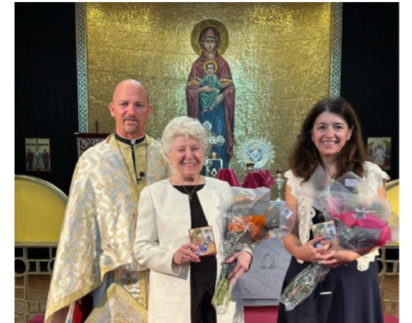
Our School Teachers Retire 9-8-2024