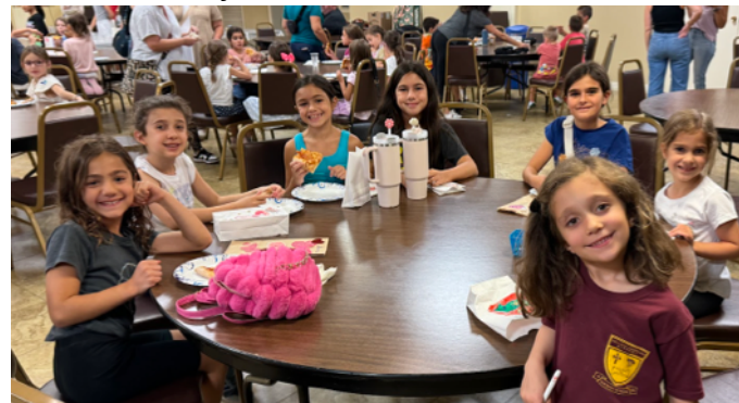
Faith Love Joy FLJ 9-20-2024