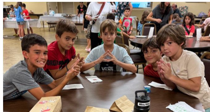
Faith Love Joy FLJ 9-20-2024