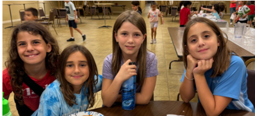
Faith Love Joy FLJ 9-20-2024