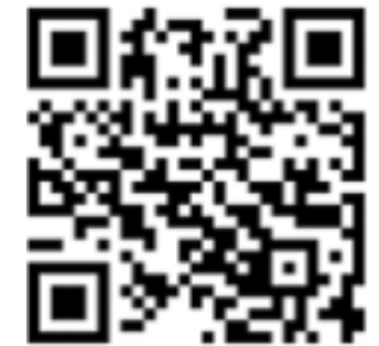
Scannable QR code

Here are links to the Connect App For iTunes download link: https://apps.apple.com/us/app/realm-connect-for-our-church/id1052274581?ign-mpt=uo%3D4 For Google Play Download link: https://play.google.com/store/apps/details?id=com.acstechnologies.android.realm.engagement&pli=1