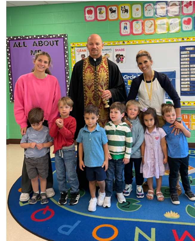
Agape Agiasmos 9-3-2024