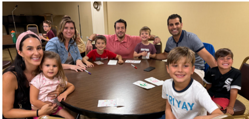
Faith Love Joy FLJ 9-20-2024