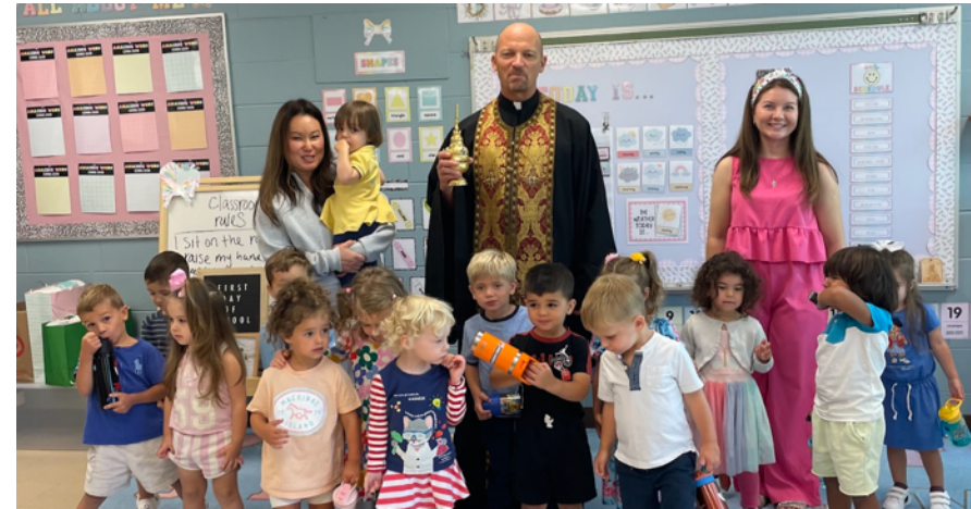
Agape Agiasmos 9-3-2024