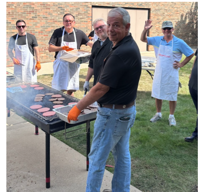
Picnic BBQ 9-15-2024