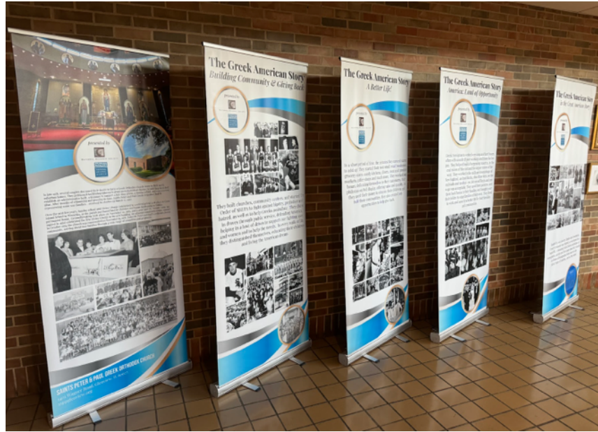
New History banners