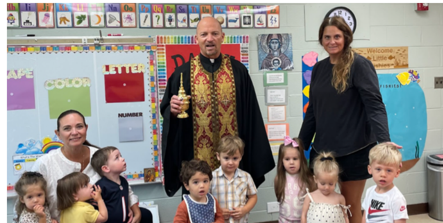
Agape Agiasmos 9-3-2024