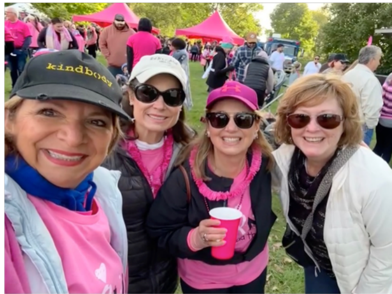
A few members of our team demonstrate the Power of Pink at last year's Breast Cancer Walk.