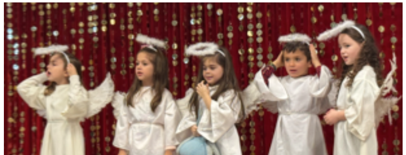
AGAPE Christmas program angels 12-18-2024