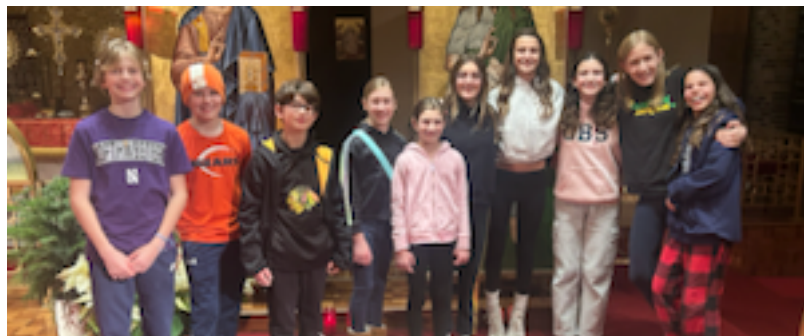
Jr. GOYA Filling the Holy water bottles for theophony. 1/3/25