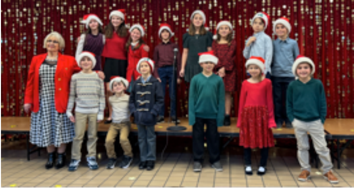
Greek School Christmas Program 12-21-2024