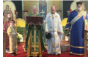
OUR LIFE TOGETHER