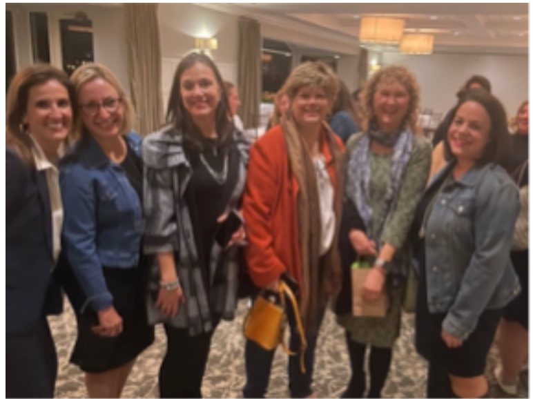
Guests at our 2022 Mix and Mingle enjoyed a lively night out.