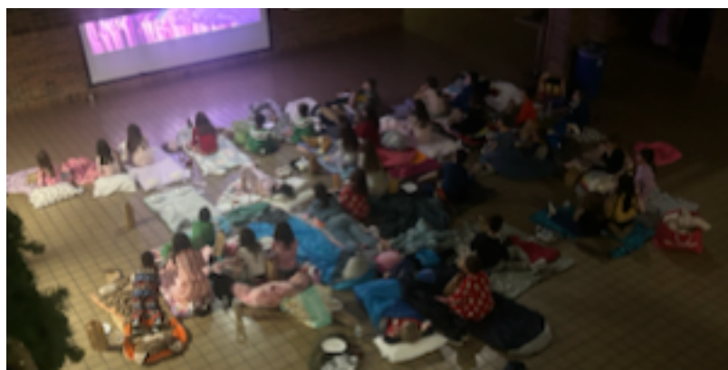
FLJ Movie night in their pjs and sleeping bags. 1/10/25