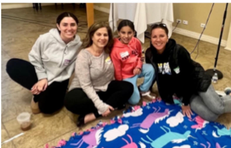
Participants in last year's Blankets for Babies complete a unicorn comforter.

You can also make donations in advance by going to https://ssppglenview.org/philoptochos-blankets-for-babies/ or mailing them to SS Peter and Paul Philoptochos, Atten: Blankets for Babies, 1401 Wagner Road, Glenview, IL 60025.