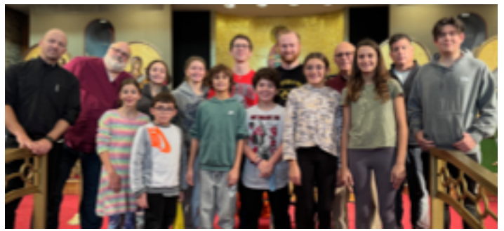
Sanctuary Cleaning Crew 12-21-2024