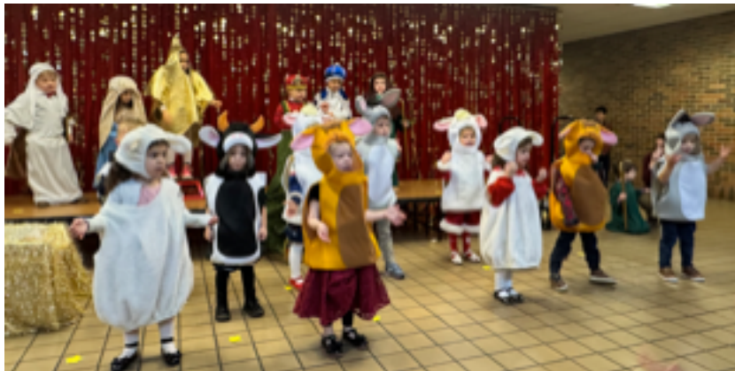
AGAPE Christmas program animals 12-18-2024