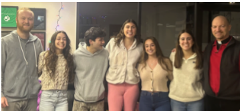
GOYA Alumni Meeting 12-19-2024