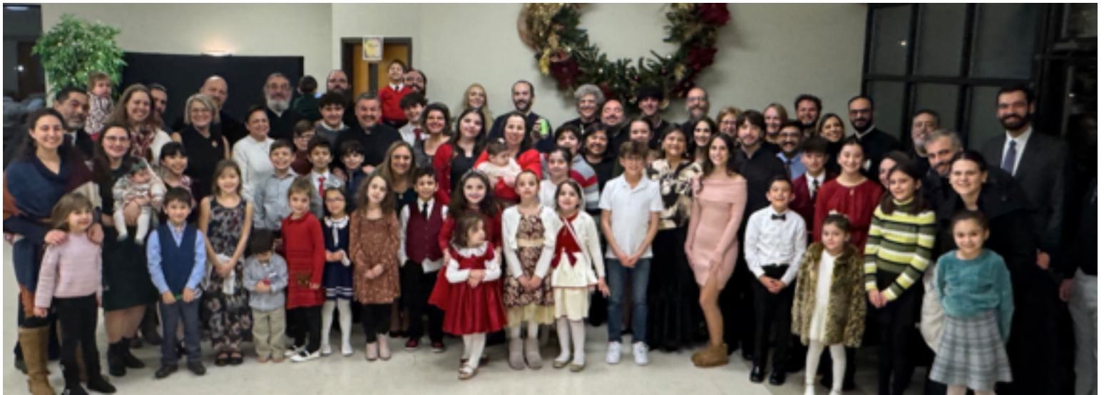
Clergy Family holiday party in Racine WI 12-29-2024