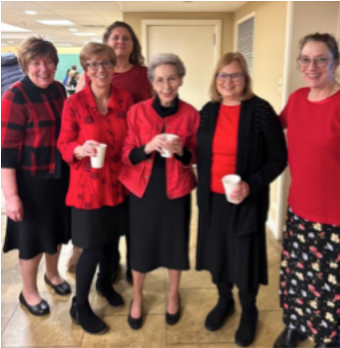
Ladies of SSPP Wear Red in support of raising awareness about heart disease in 2024.

Together, let's strive for healthier hearts and a stronger, more informed community. We look forward to seeing you there ... and remember to Wear Red!