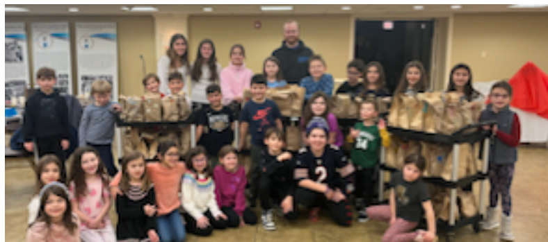
FLJ group photo with 148 packed bags of food for those in need. 1/22/25