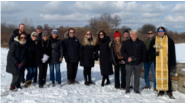
Outdoor Agiasmos Glenview 1-11-2025