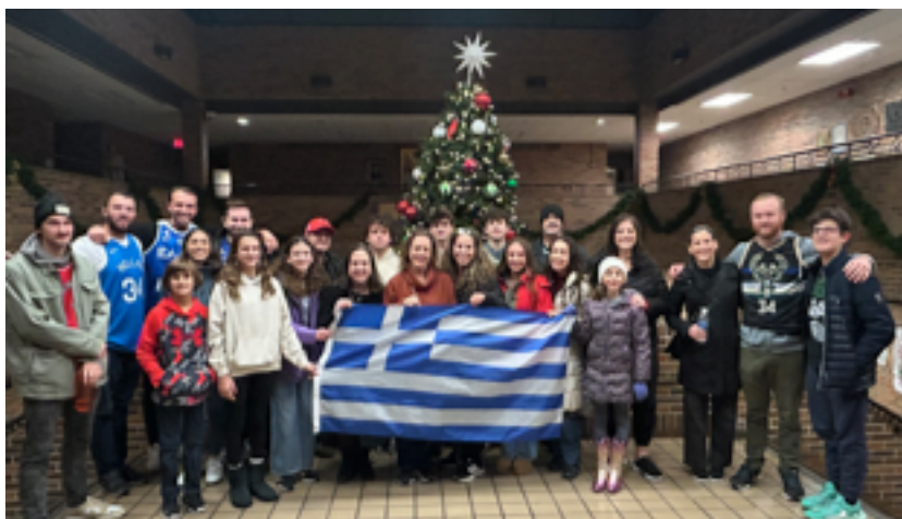
Greek Night - Chicago Bulls 12-23-2024