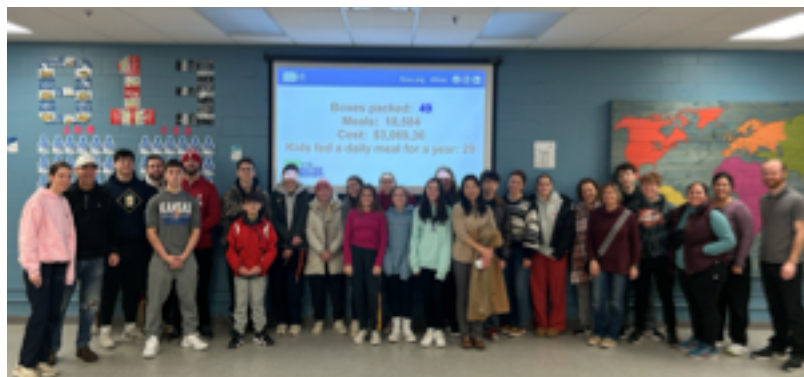
Group photo of Feed my starving children. 1/21/25