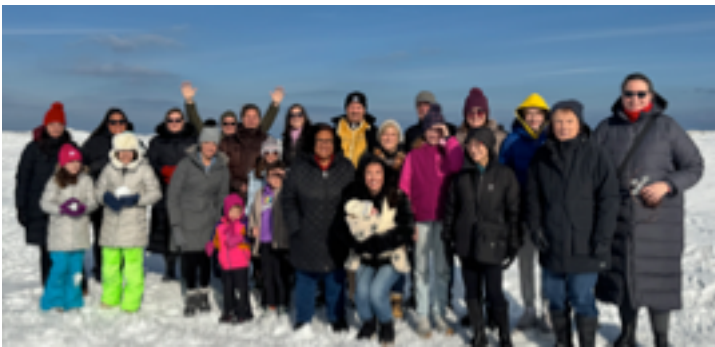
Outdoor Agiasmos Wilmette 1-11-2025