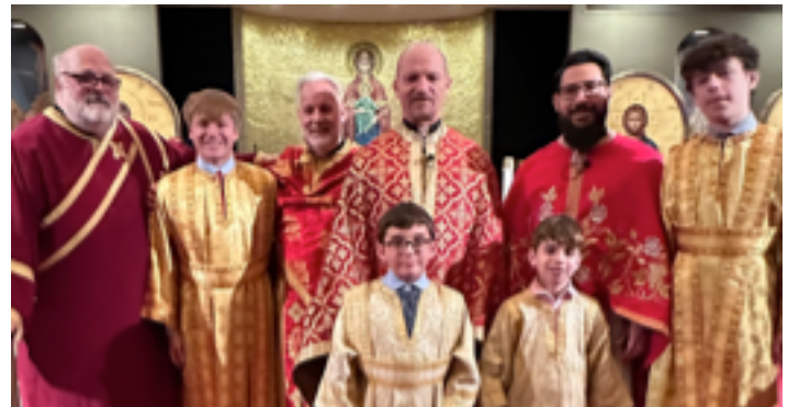
Clergy Acolytes Christmas Eve 12-24-2024