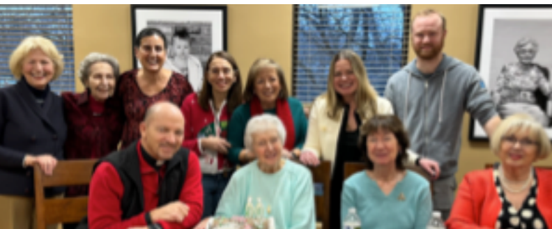
SSPP Staff Volunteer Advent Lunch 12-19-2024