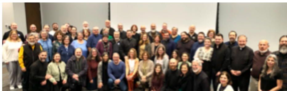
Clergy Couple Retreat Florida Jan 2025