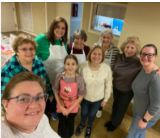
Prosfora bakers 1-25-2025