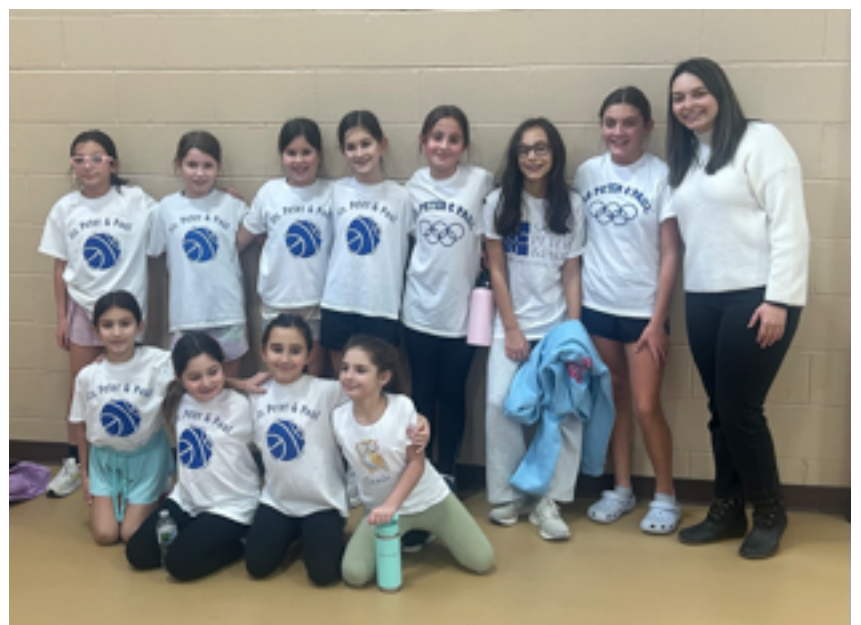
OUR BASKETBALL TEAMS 2024-2025 SEASON