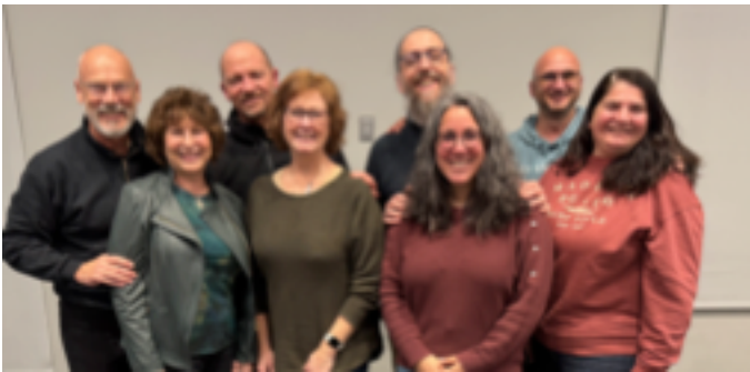
Clergy Couple Retreat - Chicago cohort

Church School's students are starting Lent by giving. We collected over 55 bags full of food items for the needy. Thank you to all who participated in Brown Bag Sunday!