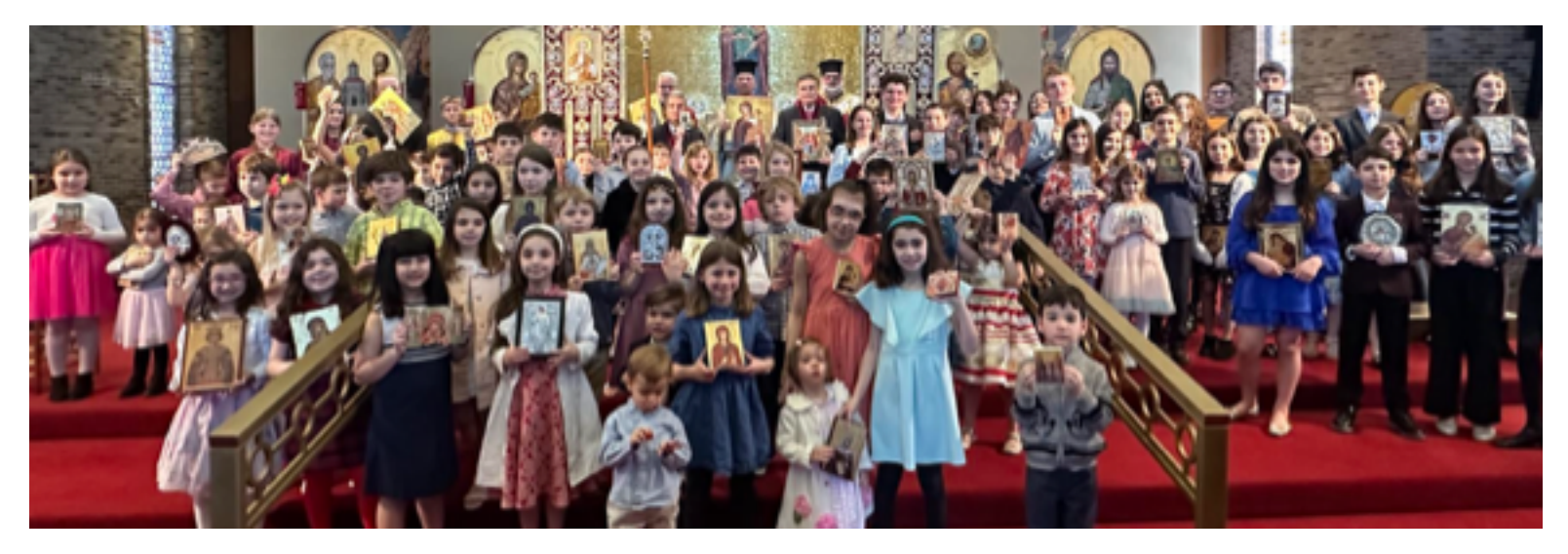
All of our youth participated in a beautiful and moving procession on Orthodox Sunday. A beautiful site to see so many excited Orthodox Christians!