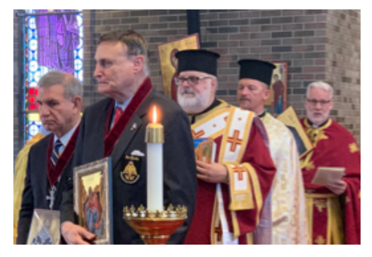
Sunday of Orthodoxy Icons 3-9-2025