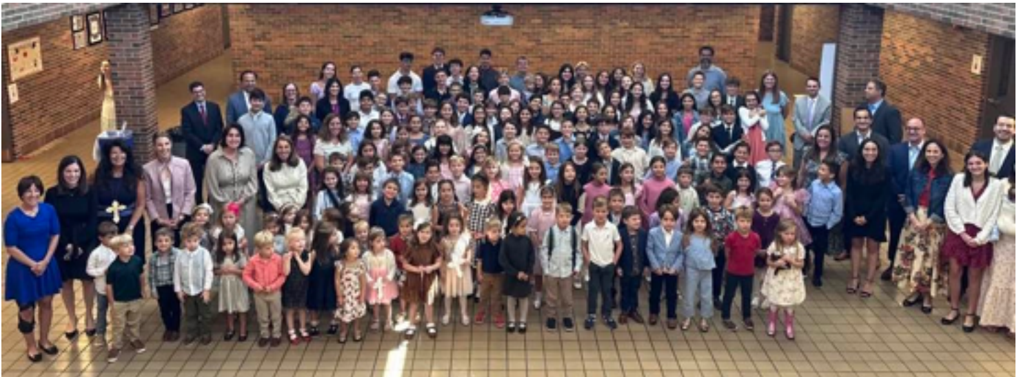
First Day of Church School 2025 9.7.25