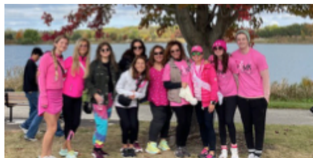
Some of our team members on a beautiful fall day at our 2024 Making Strides Against Breast Cancer Event