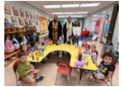
Our Life Together pg 12