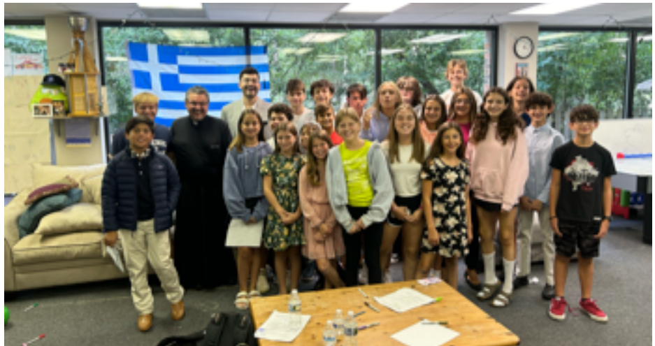
Group Photo of GOYA Kickoff 9/7/25