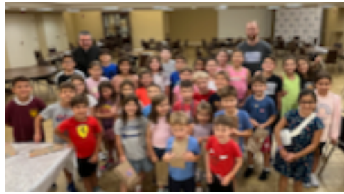
Youth Update pg 10