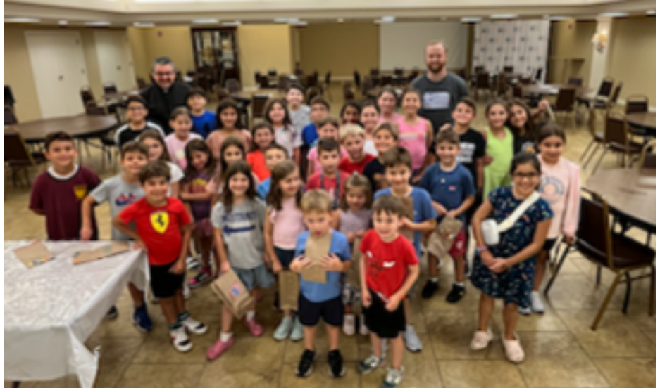
Group Photo of FLJ Kickoff. 9/12/25