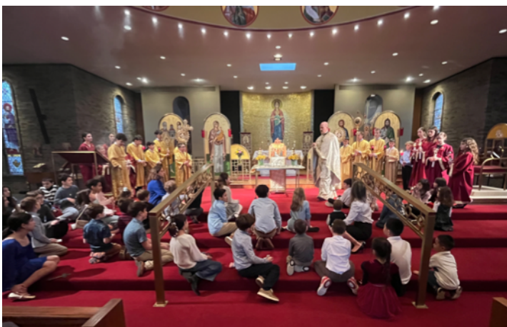
Veneration of the Cross 2026