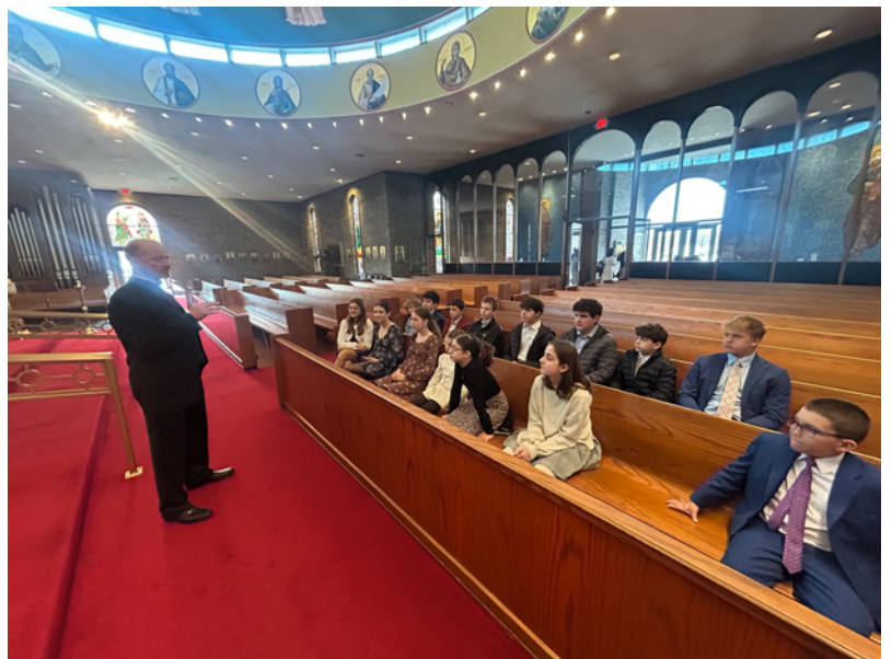
Acolyte Myrrhbearer Reader Training 3-15-2026