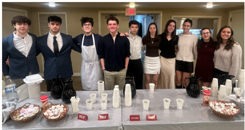
Senior GOYAnS during coffee fellowship 2/22/26