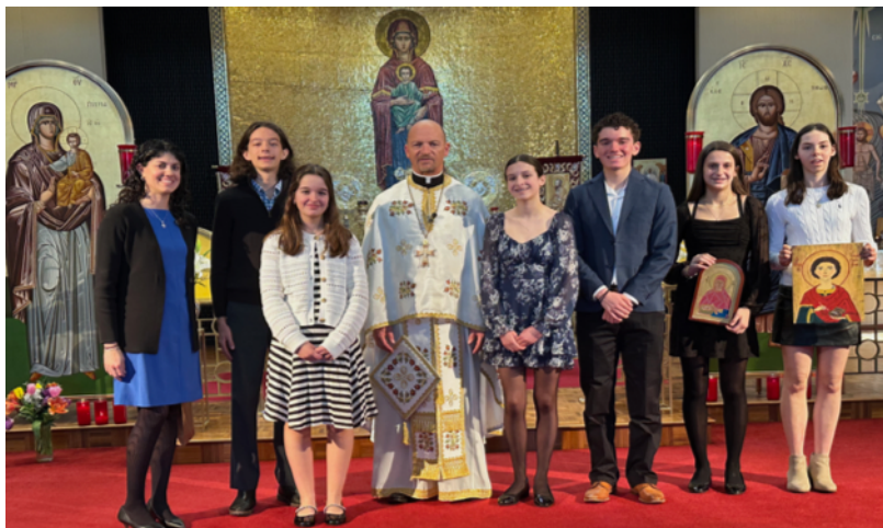
SSPP Oratorical Festival 2026