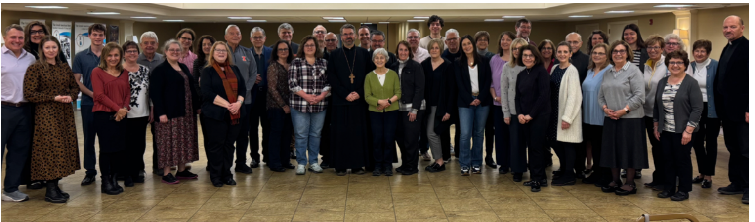
Lenten Retreat 2026