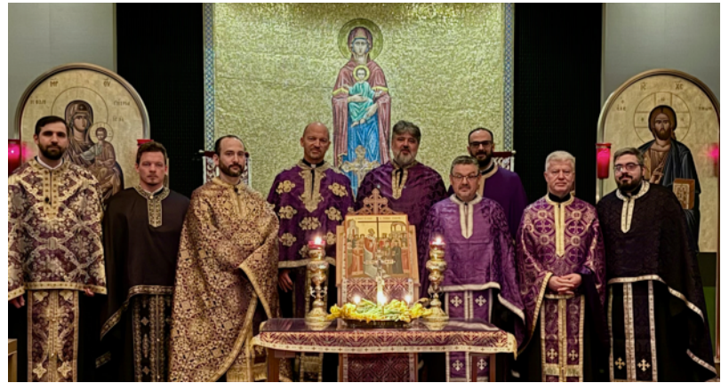
SSPP Lenten Vespers 3 - 15 - 2026