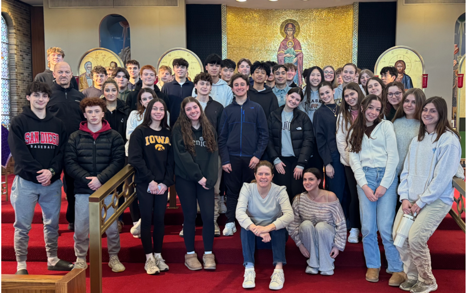
Glenbrook North High School Students Church Tour 3-13-2026