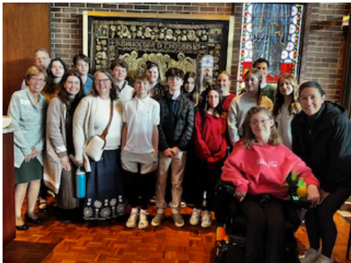
Glenview Community Church Visit 3-8-2026