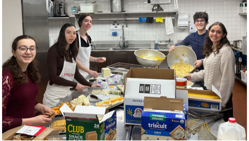
Senior GOYAnS baking Pasta for cheesefare Sunday 02/22/26