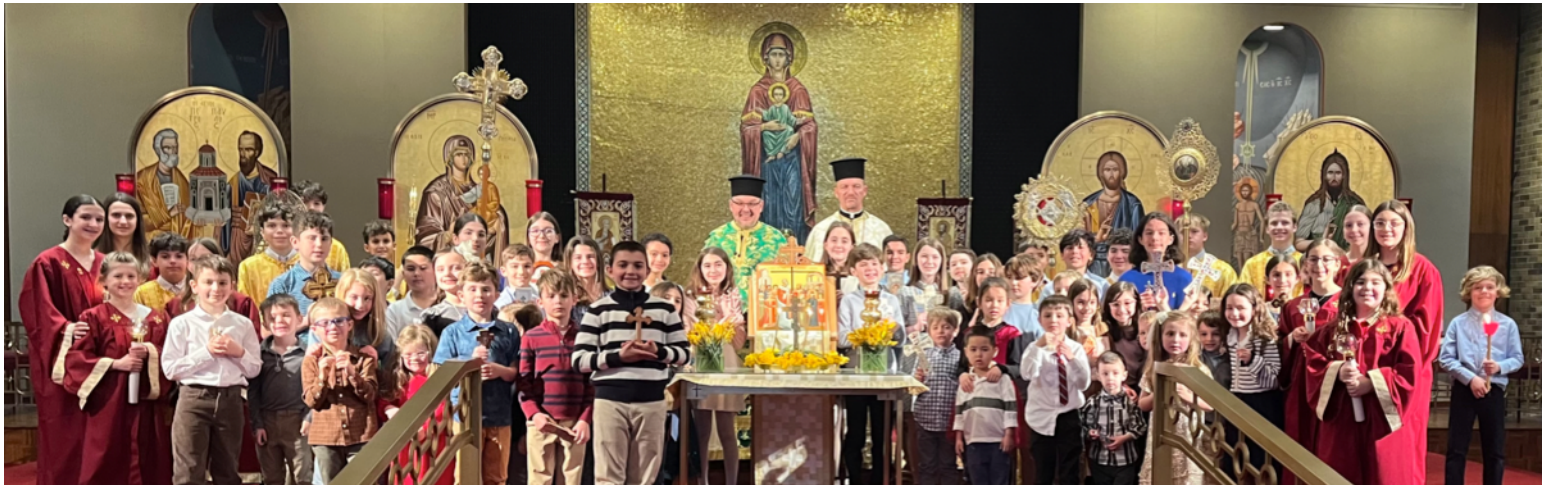
Veneration of the Cross 2026