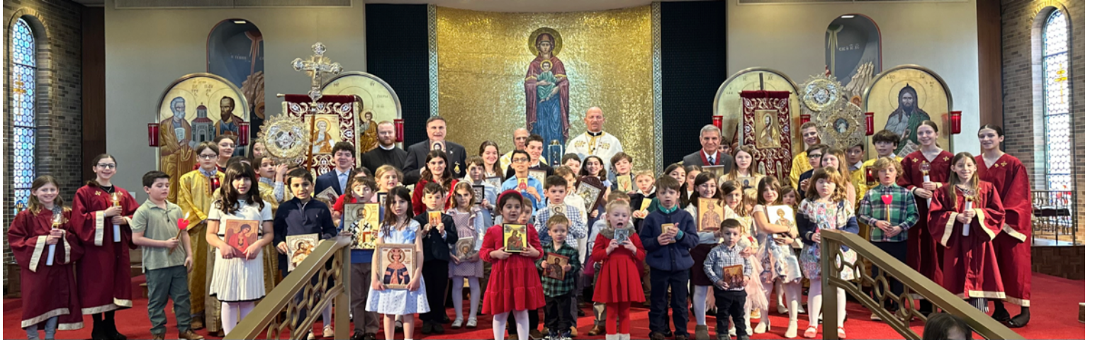
Sunday of Orthodoxy Icons 2026