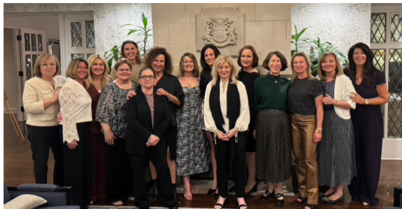
Philoptochos Board members gathered in proud support of this beautiful event and the charity it benefits