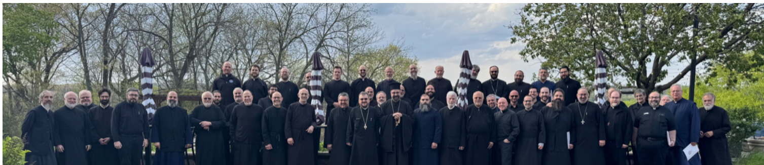
MOC Clergy Retreat 5-5-2026