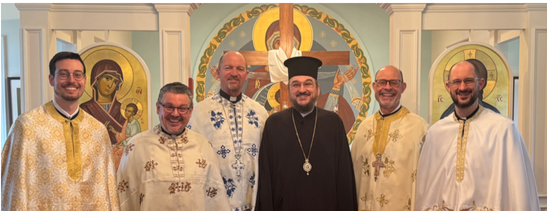
Syndesmos officers with Bishop Dionysios 5-6-2026