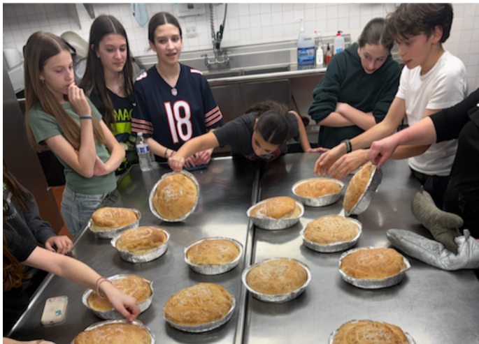
Junior GOYA Baking Prospora 2/13/26