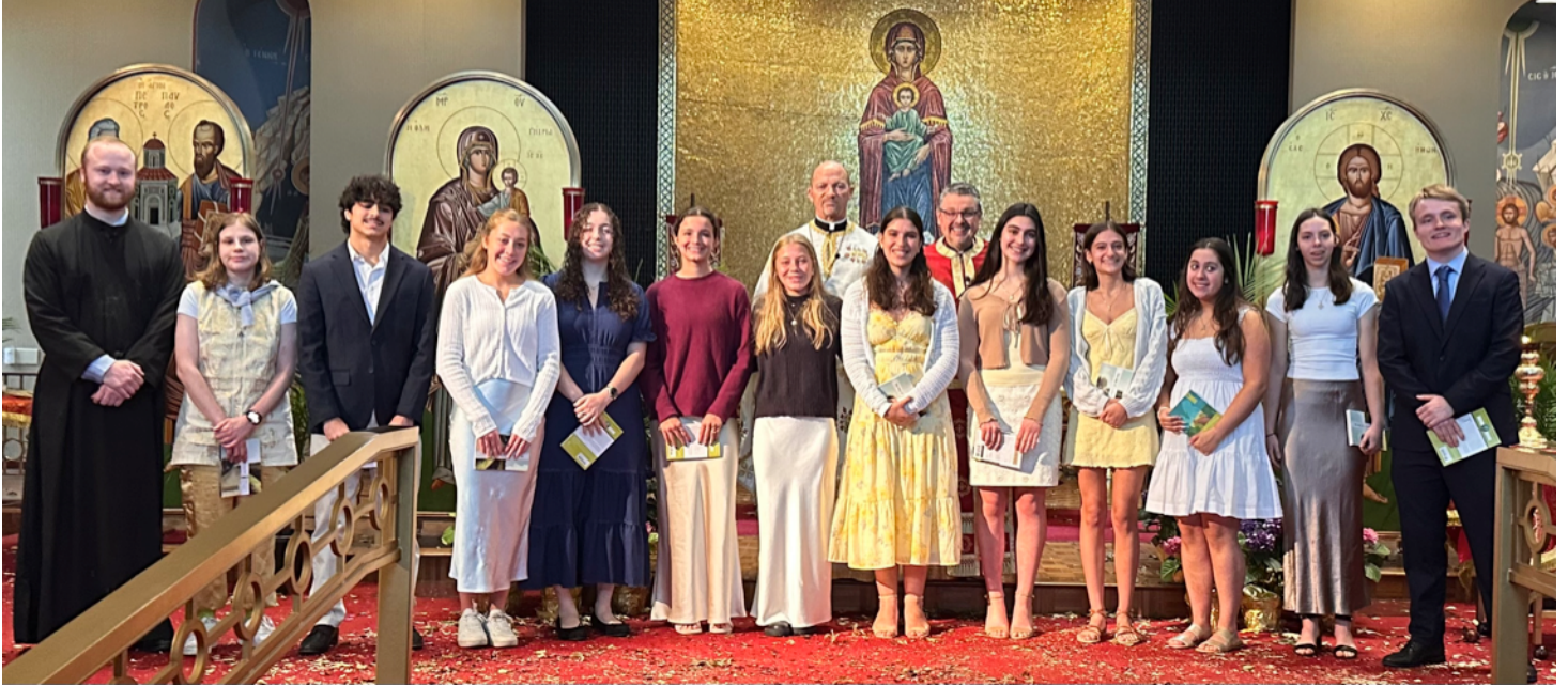
SSPP High School grads 5-3-2026