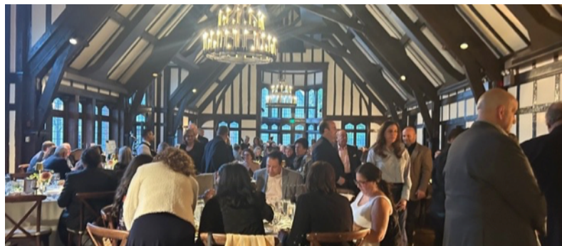
The Glen View Club was a magical venue for our packed house!