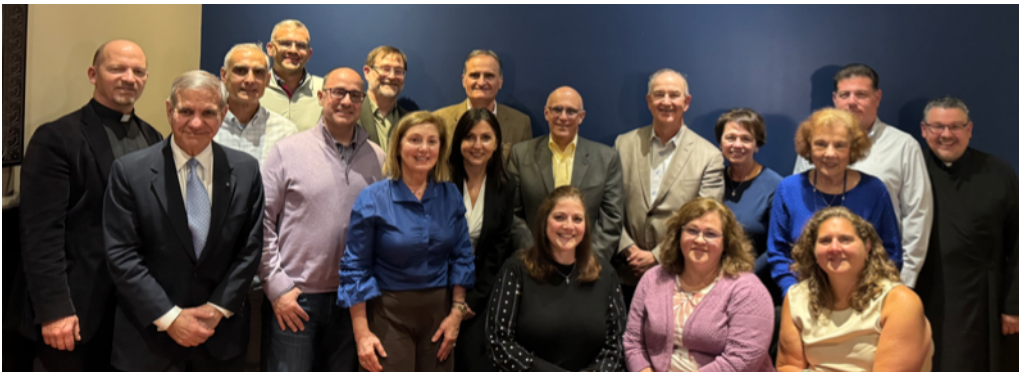
Parish Council dinner 4-18-2026