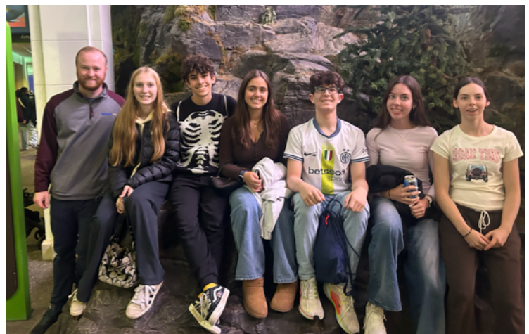
Senior GOYA Visits Aquarium 4/25/26