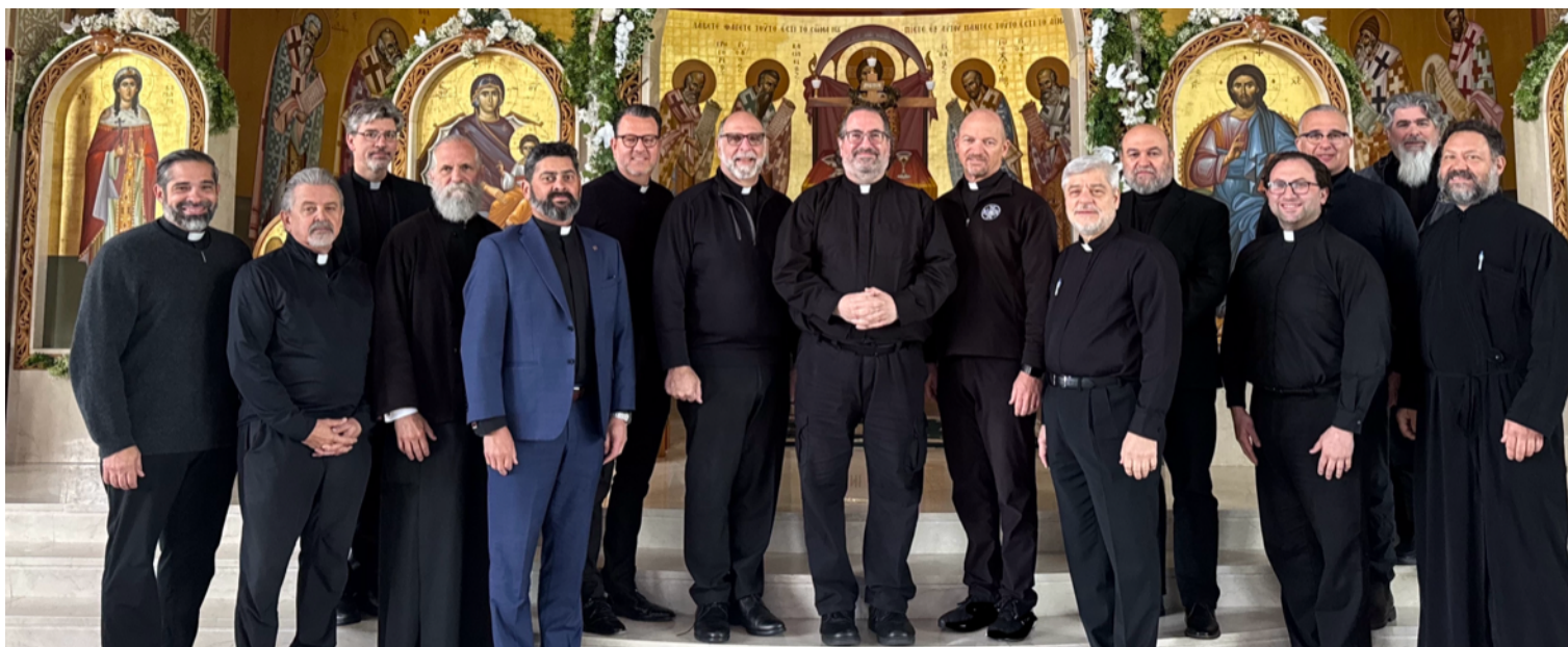
APC Meeting in Orange, CT 5-13-2026